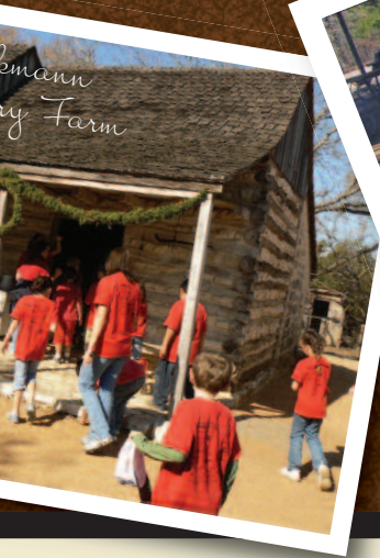
Sauer-Beckmann Living History Farm