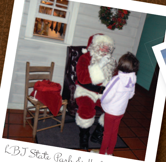
LBJ State Park & Historic Site