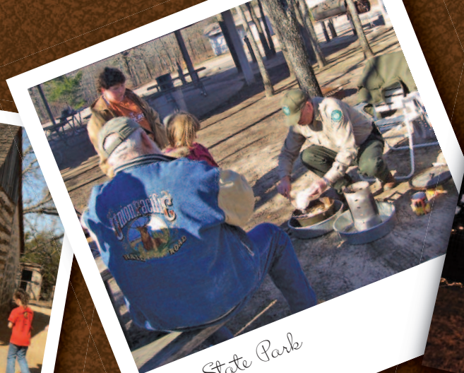
Tyler State Park