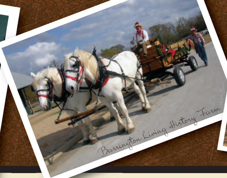
Barrington Living History Farm