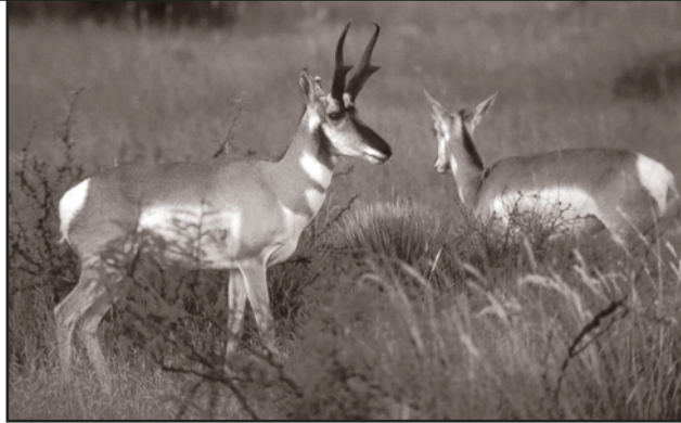
Pronghorn Antelope are among the many animals found at Caprock.

The geology of the park greatly affects the flora and fauna. Most sites above the escarpment are on the High Plains and are short-grass prairie, which includes blue grama, buffalograss and sideoats grama. The canyons in the western portion of the park support several species of juniper as well as scrub oak. The bottomland sites along the Little Red River and its tributaries support tall and mid-level grasses including Indian grass, Canada wildrye and little bluestem, cottonwood trees, wild plum thickets and hackberries. The park abounds with wildflowers in the spring and has a variety of yuccas and multi-flowering cacti.