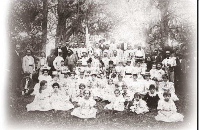
Fayette County citizens enjoying good times on the bluff with Kreische's Bluff Beer.