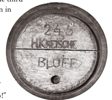
Kreische's Bluff Beer

When a new batch of beer was ready Kreische raised a banner emblazoned with the traditional German phrase "Frisch Auf!" meaning "Freshen Up!" This served as an invitation