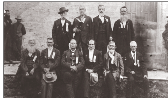
Survivors of the Dawson and Mier Companies; one in three men died in combat or illness, injury or by execution. For years after the 1848 reburial, veterans met annually to remember those who had not returned home alive to Texas.

In 1933, the present granite vault was placed around the old tomb. The adjacent 48-foot shellcrete monument, erected by the Texas Centennial Commission, was dedicated in 1936, the centennial of Texas independence.