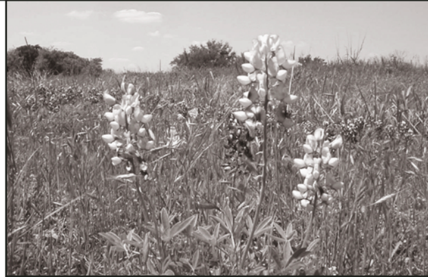
During the spring and summer, the prairie comes alive with wildflowers like these Texas bluebonnets in blue, pink and white.