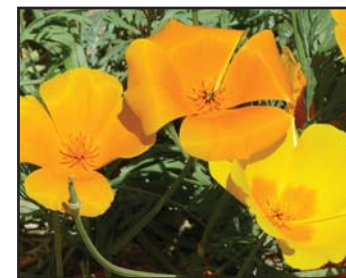
Mexican gold poppies butter the park's hillsides during early spring.

The Franklin Mountains lie within the northern Chihuahuan Desert, but other geographic regions exert influence as well. Watch for the large southwestern barrel cactus, a Sonoran Desert species, growing up to 6 feet tall on foothill slopes. New Mexico locust and Gambel's oak provide a taste of the Rocky Mountains on high peaks, although the park's predominant vegetation is decidedly Chihuahuan. Notice the abundance of small cacti, succulents such as yucca, sotol and agave; thorny shrubs, low grasses and desert wildflowers—all specially adapted to survive the rigors of desert life.