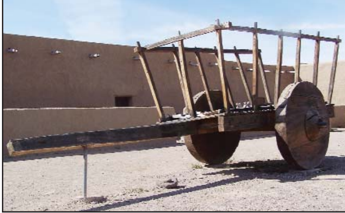
Carretas were used to move freight on the Chihuahua Trail.

Although Fort Leaton was not a military fort, the U.S. Army maintained an intermittent presence. As shown here, members of the U.S. Cavalry visited the site in 1916.