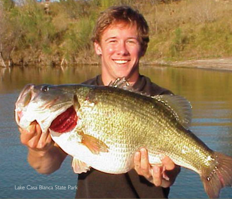
Lake Casa Blanca State Park