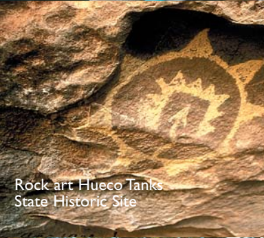
Rock art Hueco Tanks State Historic Site