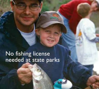
No fishing license needed at state parks