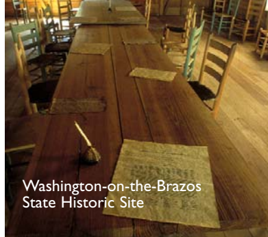
Washington-on-the-Brazos State Historic Site