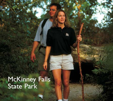
McKinney Falls State Park