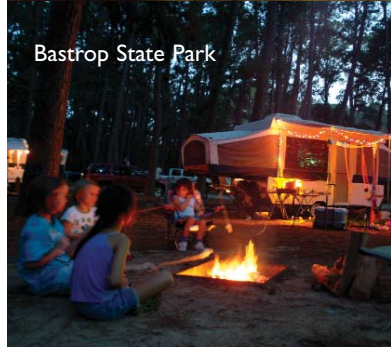
Bastrop State Park