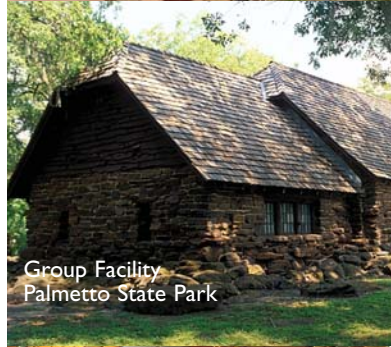
Group Facility Palmetto State Park