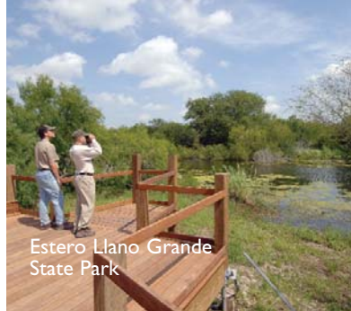
Estero Llano Grande State Park