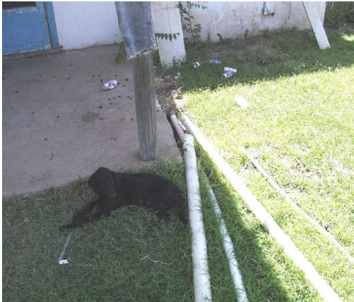
Exposed sewage system