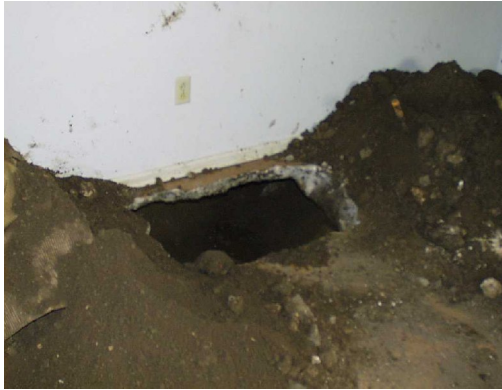
Damage caused by a leak

It is recognized that many families in the City of Lubbock are living under severe housing conditions.