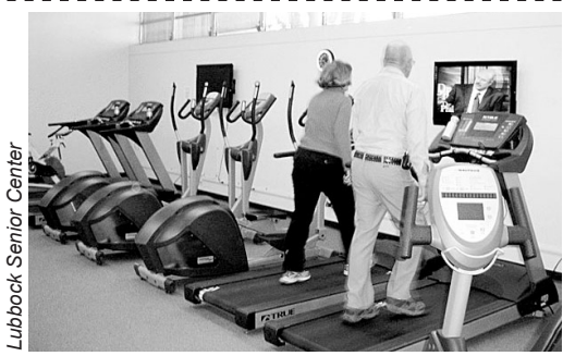
Parks & Recreation is a Member of the Health Lubbock Committee

Sign-up until August 30. Play begins September 7, 2009 Contact Tennis Center for more information at 767.3727