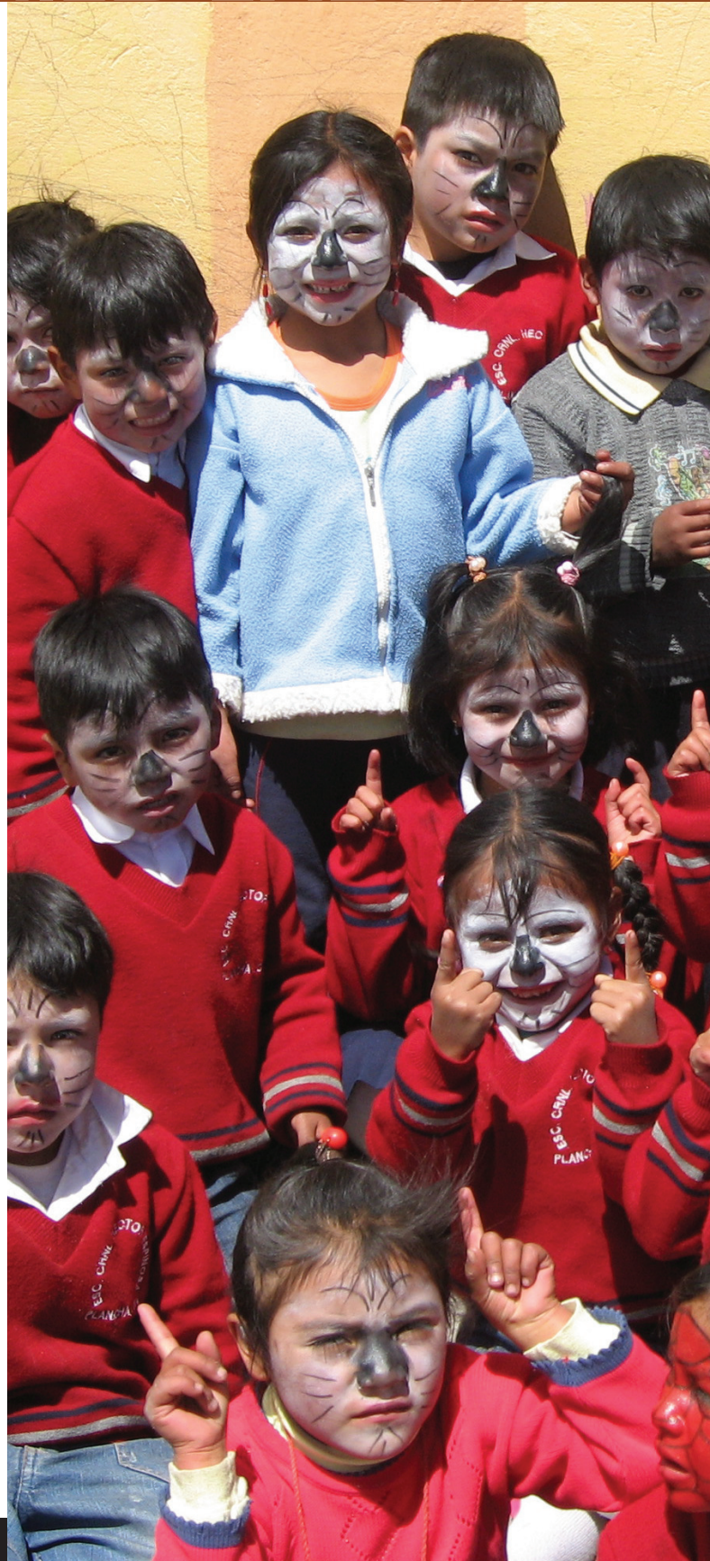
Children at risk of exploitive labor in Ecuador attend a USDOL-funded afterschool enrichment program.

As described in the country profiles, many other donors, governments, international and non-governmental organizations, and employers and workers groups provided funding, other resources, and services over the past year to protect children from exploitive child labor. For example, during the period, the EU provided approximately USD 23.8 million to the Tackle Child Labor Through Education project, which is being implemented by ILO-IPEC in 11 countries.