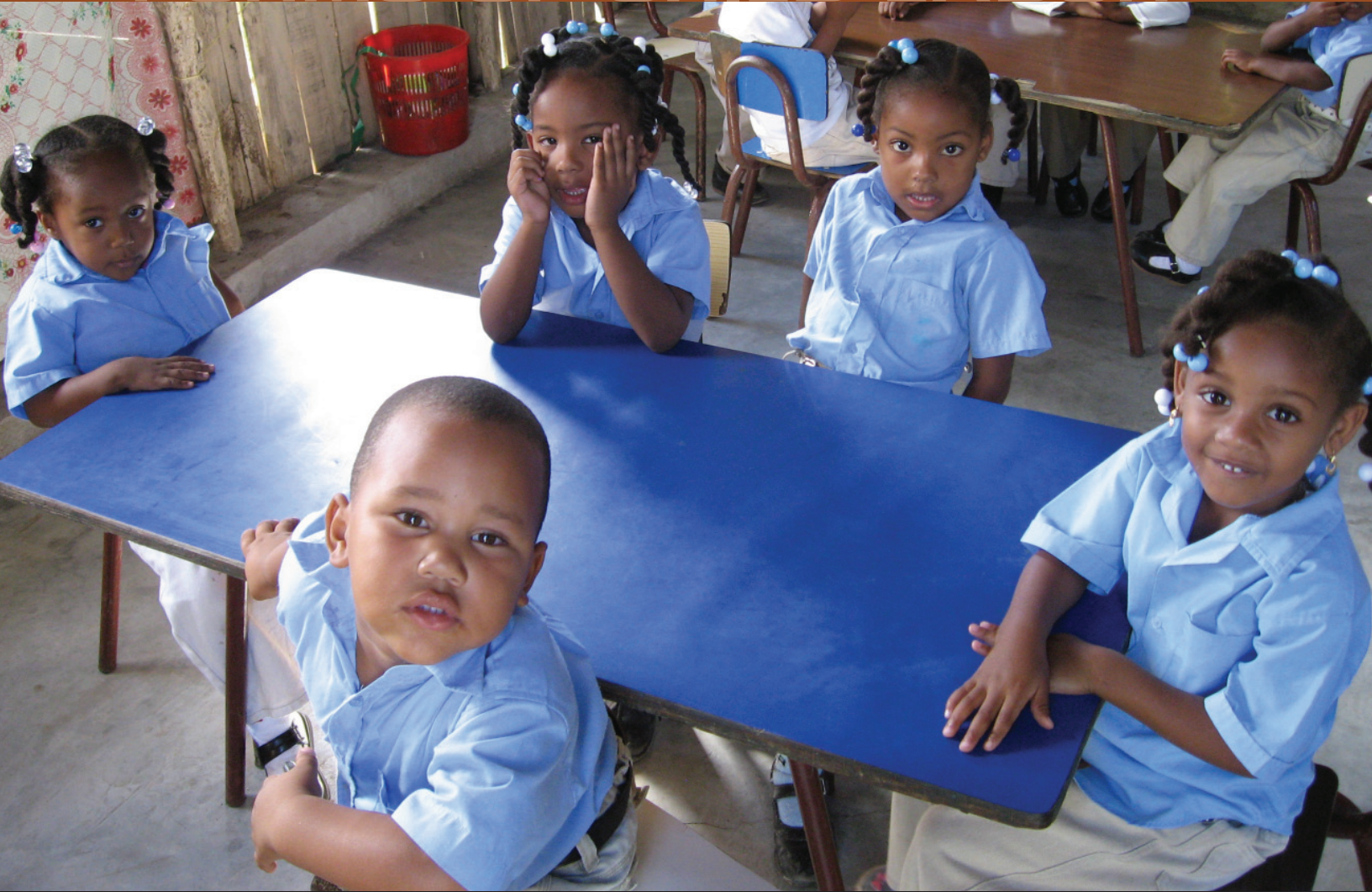
Children at risk of exploitive labor in the Dominican Republic attend a USDOL-funded afterschool enrichment program.