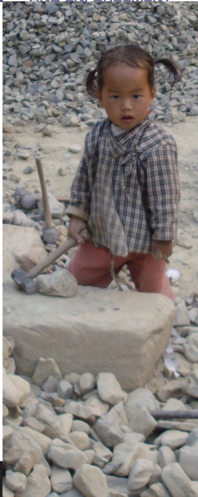
Young Nepalese girl breaks stones in a quarry

Several countries modified their minimum age and compulsory education laws during the period, which may delay the entry of children into the workforce. The African nation of Sao Tome and Principe increased the age to which education is compulsory from 13 to 15. This will likely encourage some children to postpone their entry into work, although children may legally begin working at 14 years of age. Macedonia also increased the age to which education is compulsory—from 16 to 18 years. In Nepal, the Government made education compulsory and free through the eighth grade. Argentina increased the legal minimum age for employment from 14 to 16 years, and specifically prohibited the employment of children under the age of 16 in domestic services. In Egypt, the minimum age for employment was increased from 14 to 15 years. Despite these advances, countries such as Benin, Burundi, Comoros, Equatorial Guinea, Guinea, Mozambique, Niger, Suriname, Swaziland, Trinidad and Tobago, and Uganda continue to allow children to leave school before reaching the minimum age for work, providing