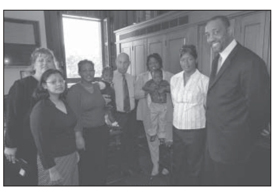
Senator John Whitmire meets with teenage mothers participating in a residential infant care and parenting program for teen mothers who are incarcerated with the Texas Youth Commission called Women in Need for Greater Strengths (WINGS). Senator Whitmire is the sponsor of the 1999 legislation which created this program.

been growing, will increase beyond the operational capacity in 2006, and beyond the available population capacity in 2008. While the prison population is increasing, the number of people who are on probation is decreasing. Because Senator Whitmire's top priority is ensuring the public safety, he is currently working on legislation to allocate state resources so we have the prison space available to confine those who commit violent crimes while