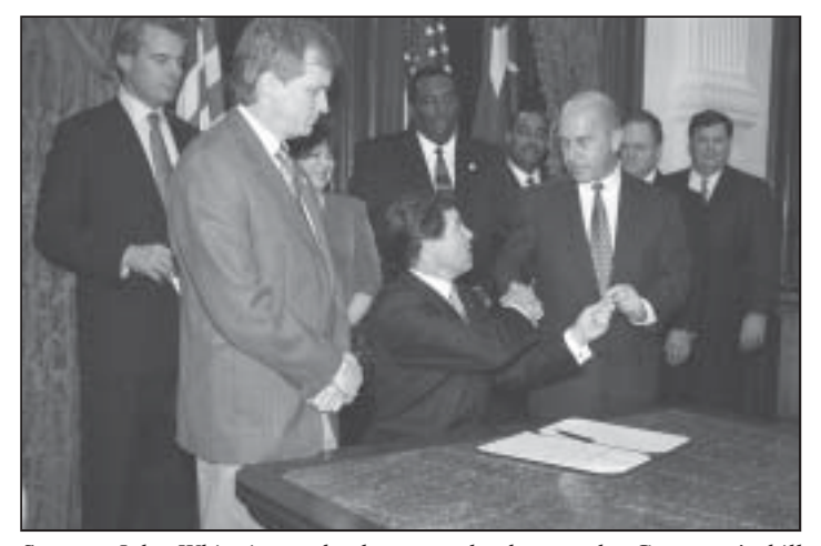
Senator John Whitmire and other state leaders at the Governor's bill signing ceremony for Whitmire's legislation that allowed the Tulia 13 to be released on personal recognizance bonds.

on bond as provided for in Senator Whitmire's legislation. They were later pardoned by the Governor.