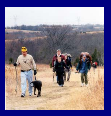
Parkhill Prairie Lake

From rodeos to lazy-day picnics with your family, Collin County offers five unique outdoor experiences.