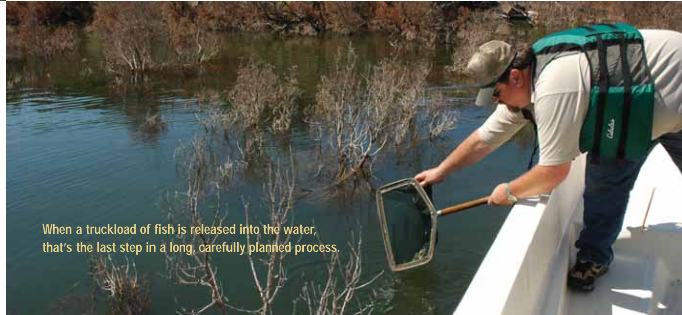
When a truckload of fish is released into the water, that's the last step in a long, carefully planned process.

These hatcheries are open to the public and available for tours. For details: www.tpwd.state.tx.us/fishboat/fish/management/hatcheries/