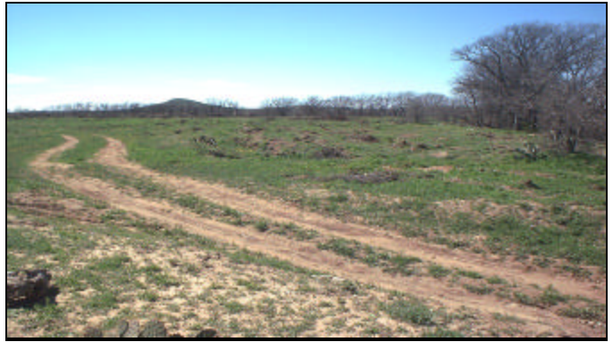
Vegetation is returning following brush control work.

Additional funding may be needed to complete the treatment in the 152,000-acre watershed. Projections indicate that over the life of the project, the treatment of targeted acres may result in approximately 66,000 acre-feet increase in water within the Oak Creek Watershed.