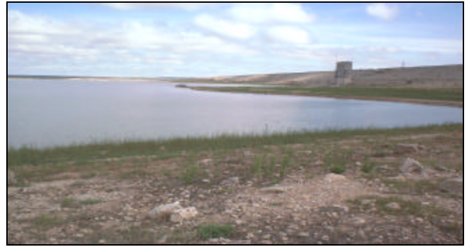
O.C. Fisher Reservoir is a water supply for the city of San Angelo where water levels have fallen to dangerously low capacities.

As a result, the UCRA has focused on subbasin and small area responses for