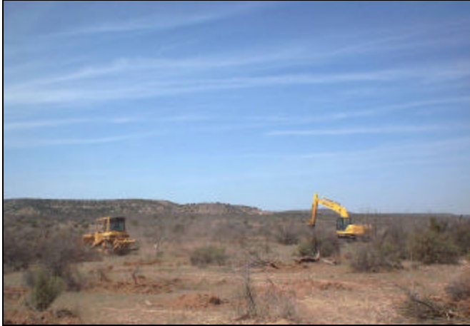
Bulldozers and other heavy machinery are used to effectively clear brush.

A brush control project was initiated in September 2002 to enhance the amount of water flowing into Champion Creek Reservoir which is located in the Upper Colorado critical area. This reservoir is an important water source for the Colorado City and their service area including the city's population of approximately 5,000 citizens and over 2,000 inmates within the TDCJ system.