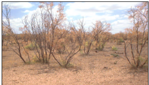
AFTER - Mesquite 2 weeks after aerial spraying.