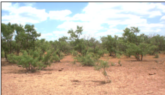
BEFORE - Mesquite before aerial spraying.

In the Mountain Creek Lake Watershed, over 7,500 acres of the 19,000-acre watershed have been targeted for brush control. Thus far, 2,034 acres have been contracted for treatment and 1,414 have been treated in this watershed.