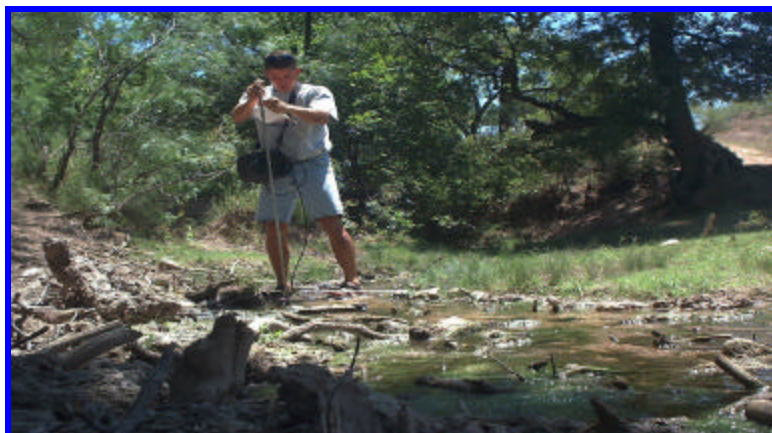
Monitoring Flow on Sterling Creek

Since the start of the pilot project, 207,537 acres of brush have been treated of the 351,689 acres under contract. It is estimated that landowners have provided cost-share in the amount of $2.9 million.