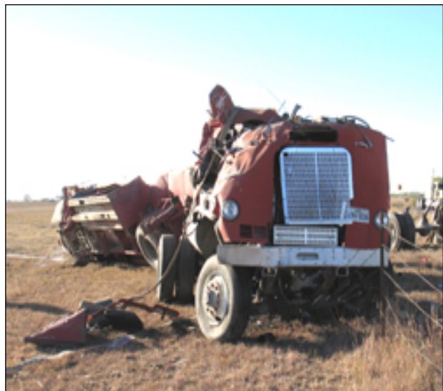
Final resting position of tractor-trailer.

During the rollover, the truck cab roof was sheared away just above the dashboard. Firefighter Rice, who was not wearing the driver's seat safety belt, was ejected from the truck cab and landed on the right hand lane of the roadway, approximately 30 feet from the final resting point of the truck cab.