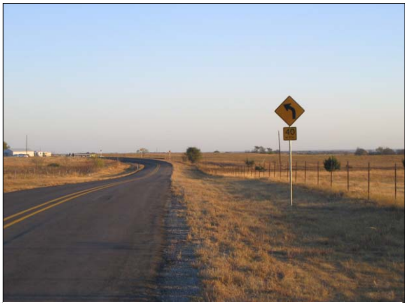
FM 219 approaching the incident scene in the direction of travel of Unit 610.

Approximately 2.5 miles from the CVFD station on Farm-to-Market Road 219, Unit 610 passed a diamond left curve sign with a 40 mph speed