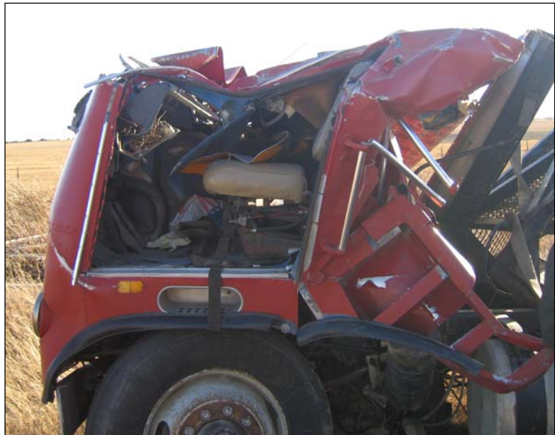
Left side view of truck cab of Unit 610

The driver's seat of the 1979 Freightliner cabover truck-tractor-owned by Carlton VFD is equipped with a lap type safety belt, but Firefighter Rice was not wearing it at the time of the motor vehicle incident. Due to the forces involved in this crash, it is not possible to determine if safety belt use would have prevented fatal injuries to Firefighter Rice.