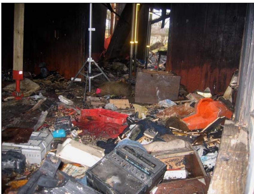
Interior of 8510 Brandon (post fire)