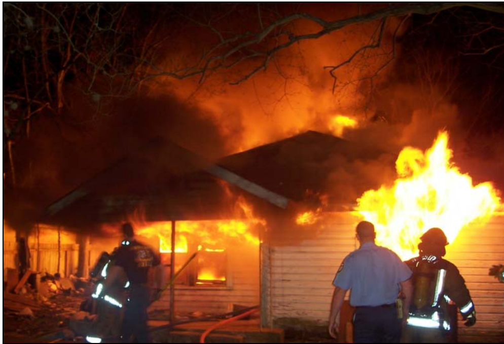
Front (East side) of 8510 Brandon at the time the roof collapse forced smoke and burning gases throughout the building. E46 and L46 crews are inside the building at this time.