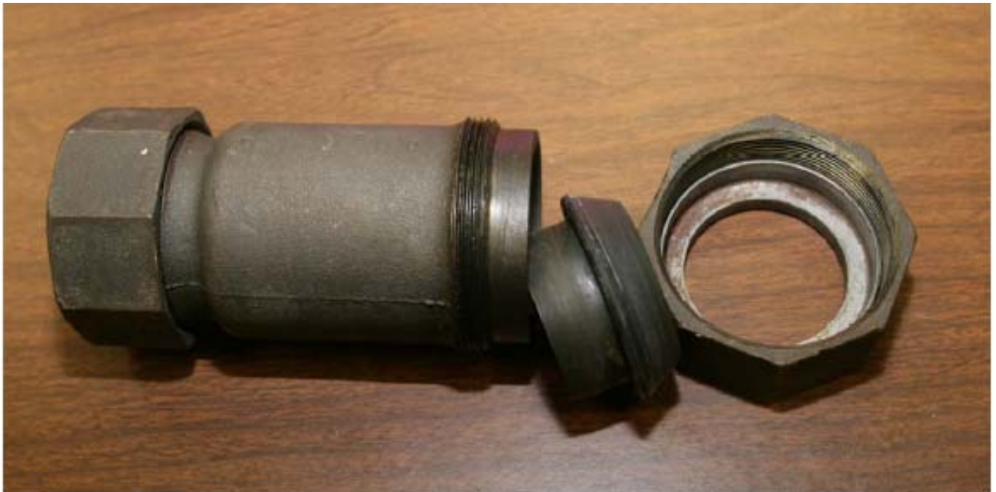
Figure 1 – Example of a Style 90 Type Dresser Coupling, Open Ended Barrel for View of Components

For the purpose of describing and explaining a typical coupling, the Dresser type coupling is pictured below. This information was extracted from a diagram created by PHMSA. Figures 1 and 2 provide examples of a typical Style 90 type Dresser coupling. A number of variations are available to join similar materials (such as steel to steel or PE to PE) or different materials (such as transitioning from steel to PE as in Figure 2). In addition to the straight coupling shown below, the Style 90 can also appear as an elbow (45 or 90 degree), tee, reducing coupling, or integrated with a riser. A variety of gaskets and sleeves exist depending on the specific application.