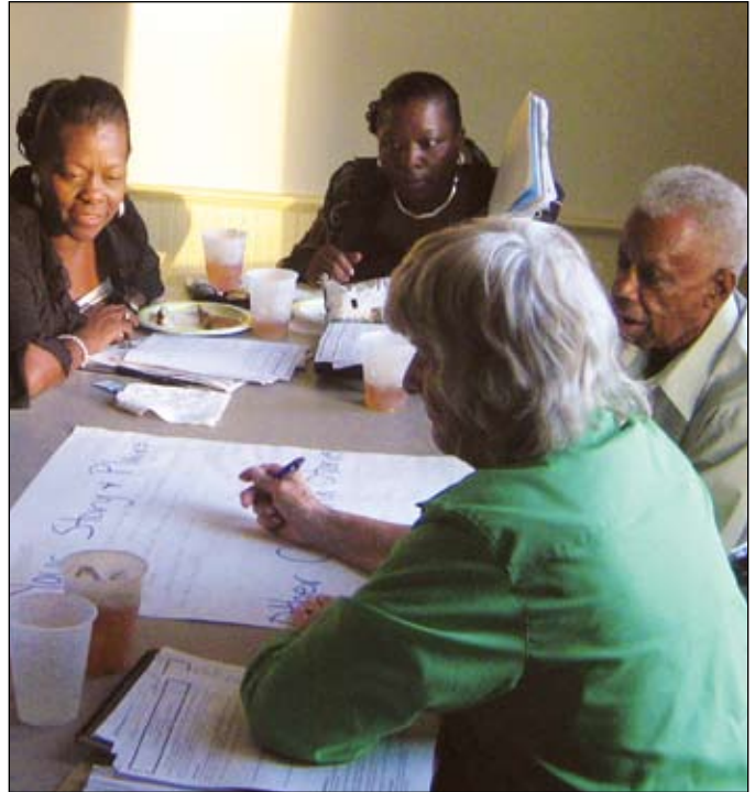
Residents of Corsicana make consensus decisions on important landmarks to preserve and protect.

The Visionaries in Preservation Program accepts applications annually the last business day in August.