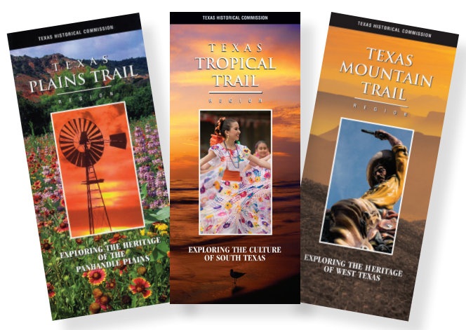
For free travel guides visit www.thc.state.tx.us/travel.