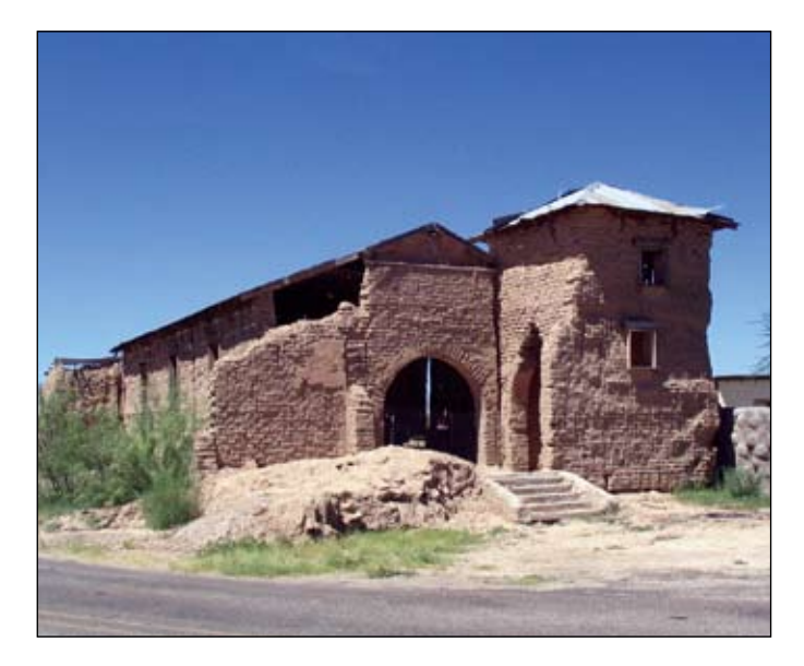
Early 1900 church in Ruidosa, Presidio County

The division oversees the care and maintenance of the THC buildings, which include an antebellum home, an 1880s church and a 1940s apartment house. Staff prepares architectural plans and specifications for rehabilitation projects related to the structures.