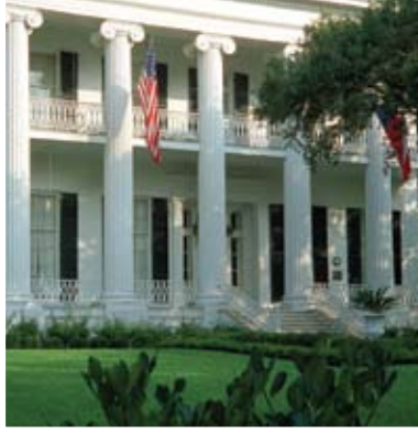
Governor's Mansion, Austin

1891 Fayette County Courthouse, rededicated on June 25, 2005