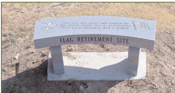
Granite bench at flag retirement site.

A ceremonial flag retirement facility was dedicated at the Central Texas State Veterans Cemetery at Killeen on June 23, 2009. The site was built and funded by Boy Scout Troop #287 in association with local businesses. The U.S. Flag Code (U.S.C. Title 10, Chapter 36) states: "The flag, when it is in such condition that it is no longer a fit-