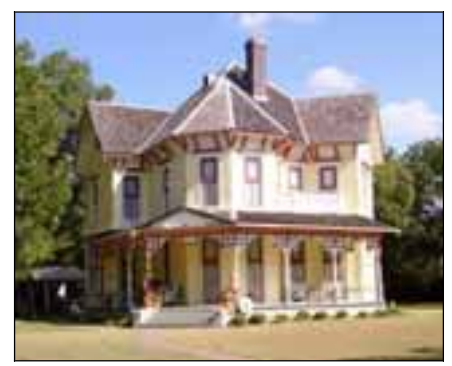
Historic Eriksen Home.

the historic homes decorated for the holidays are like walking through a real dollhouse and an experience you do not want to miss! Tickets are available at the chamber of commerce