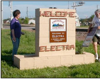
Volunteers install Electra's Preserve America Sign

side over various events during the year.