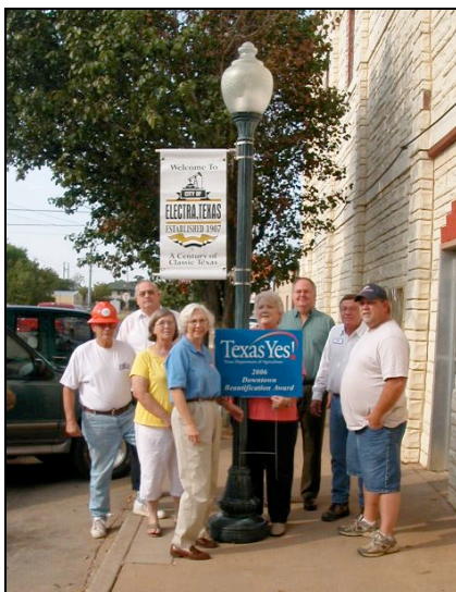
Centennial Banners for downtown.

Electra's Main Street project volunteers, active since 1998, planned