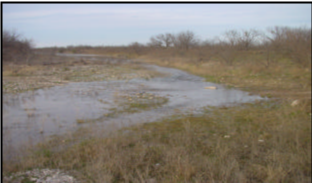
Aerial sprayed Mesquite on Pecan Creek

In the Mountain Creek Lake Watershed, over 7,500 acres of the 19,000-acre watershed have been targeted for brush control. Thus far, 1,616 acres have been contracted for treatment and 1,440 have been treated in this watershed.