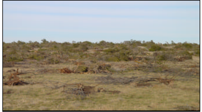
Brush recently treated in the Twin Buttes Watershed

Additional funding may be needed to complete the treatment in the 152,000-acre watershed. Projections indicate that over the life of the project, the treatment of targeted acres may result in approximately 66,000 acre-feet increase in water within the Oak Creek Watershed.