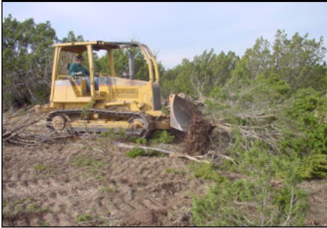
Bulldozers and other heavy machinery are used to effectively clear brush.

A brush control project was initiated in September 2002 to enhance the amount of water flowing into Champion Creek Reservoir which is located in the Upper Colorado critical area. This reservoir is an important water source for the Colorado City and their service area including the city's population of approximately 5,000 citizens and over 2,000 inmates within the TDCJ system.