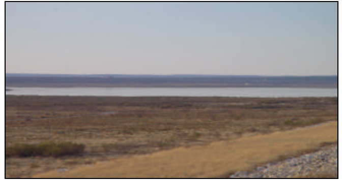
O.C. Fisher Reservoir is a water supply for the city of San Angelo where water levels have fallen to dangerously low capacities.

Through brush control, the restoration of the North Concho River is ongoing and the following effects have been observed thus far: