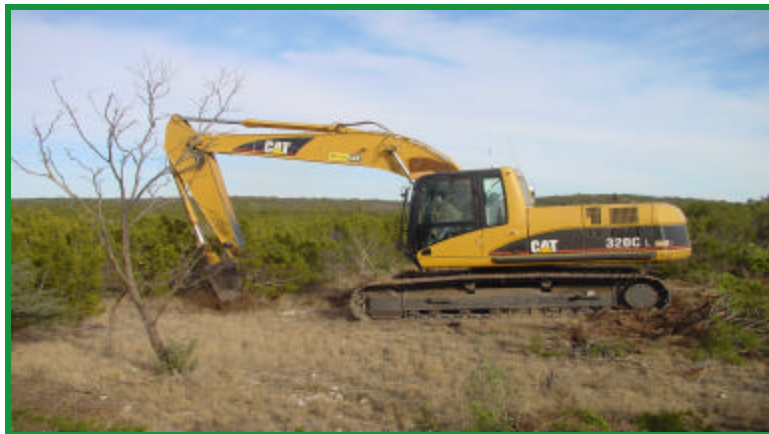
An Excavator is being used for Brush Management

As a result, the UCRA has focused on subbasin and small area responses for early indications of benefits.