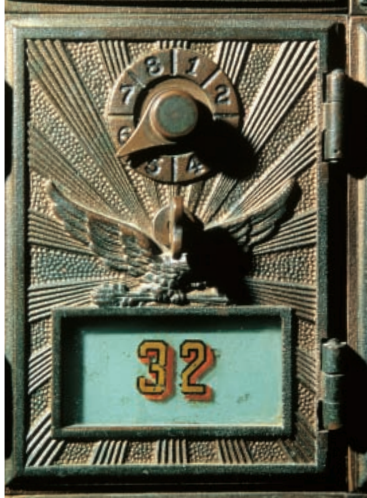
Somerville Area Museum, Somerville