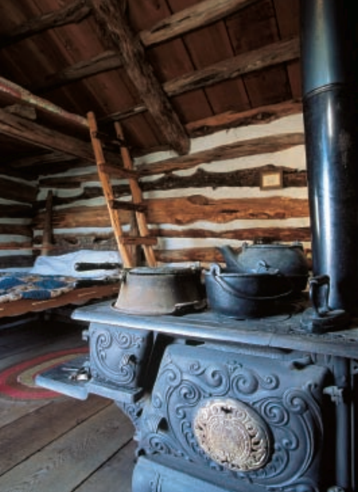
Bosque Memorial Museum, Clifton