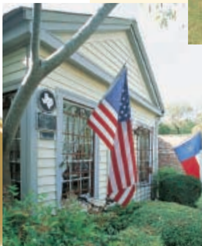
Bastrop County Historical Society Museum, Bastrop