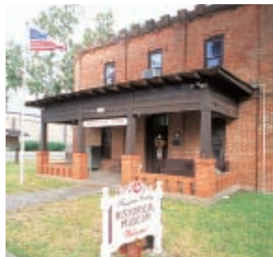
Freestone County Historical Museum, Fairfield