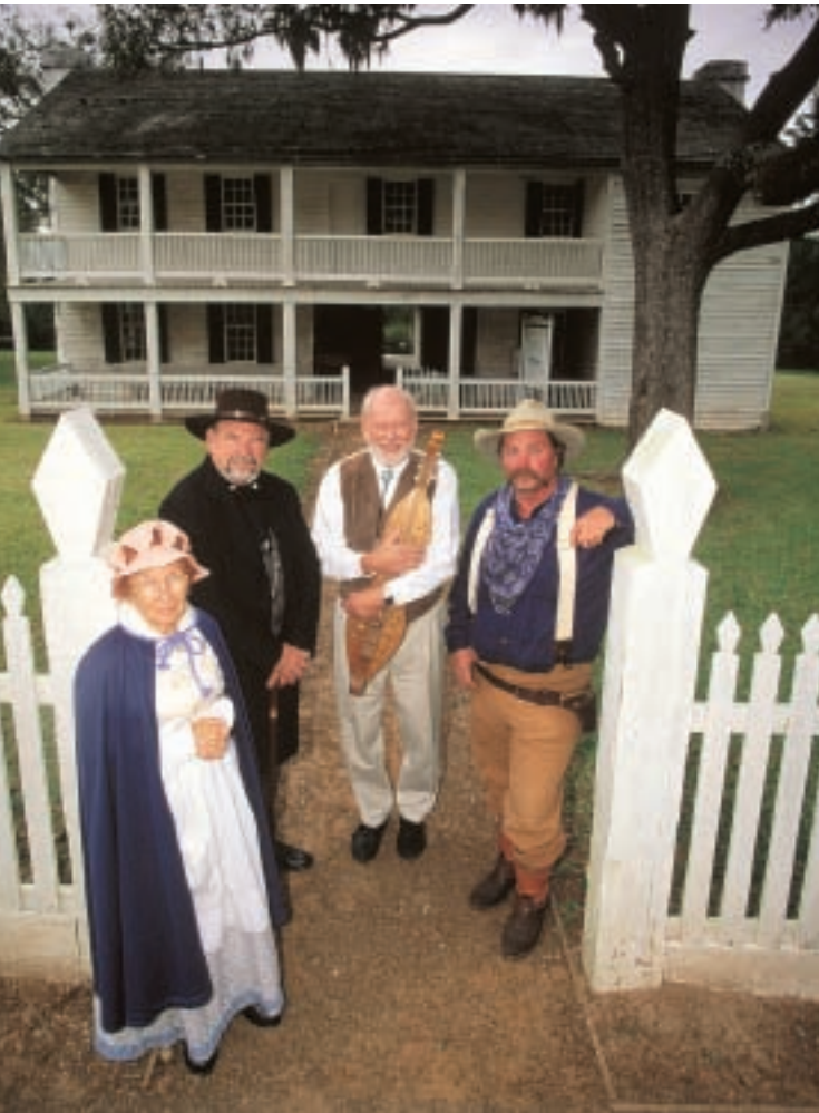
Fantborp Inn State Historic Site, Anderson

The dark, rich soil of the Blackland Prairie proved ideal for growing cotton. Like the black gold — oil — that would be discovered later, it attracted a rush of immigrants eager to make a living. Anglo and African