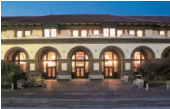
The Railroad and Heritage Museum, Temple

The Grove (pop. 40), 15 miles west of Temple, is a fascinating turn-of-the-century "ghost town" and live music venue. Established in 1859 and named for the grove of live oak trees surrounding it, this tiny farming community was once one of the most prosperous towns in the county with a post office, three general stores and a two-teacher school. The town's decline began in the 1940s and the last business closed in the early 1970s. A collector then bought the old general store, post office, saloon and blacksmith shop. The general store is filled floor to pressed-tin ceiling with antique farm implements and lanterns, patent medicines and broad axes — artifacts he rents out for films such as "Lonesome Dove" and "The Alamo." This community comes to life on the weekends with spontaneous live music performances and droves of tourists.