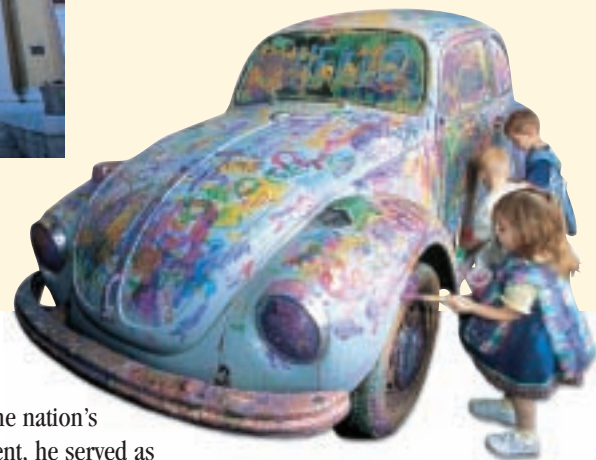
Children's Museum, Bryan

D.C. Before becoming the nation's 41st president, he served as ambassador to the United Nations, Republican Party chair, chief liaison to China, director of central intelligence and vice president of the United States. A dramatic film clip shows Bush being rescued by an American submarine after his plane was shot down over Chichi Jima during World War II. An interactive light-up map and documentary dramatize the events that unfolded after Iraq's invasion of Kuwait and the U.S. involvement in the Persian Gulf War, both of which occurred during Bush's presidency.