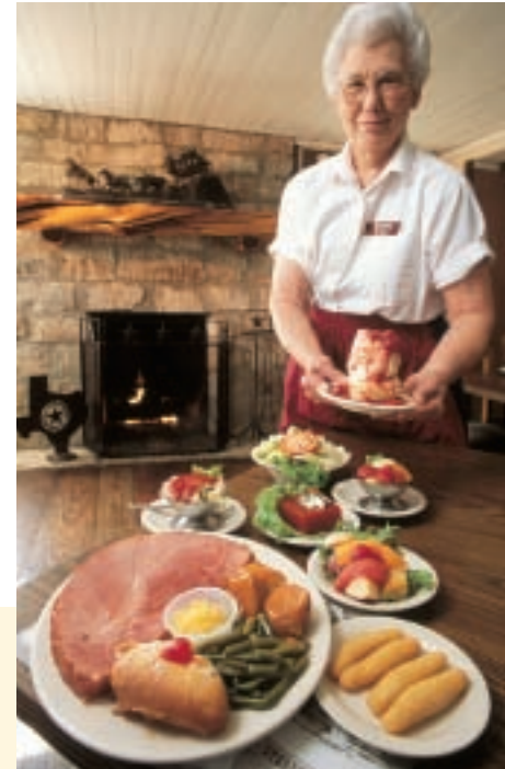
Stagecoach Inn, Salado