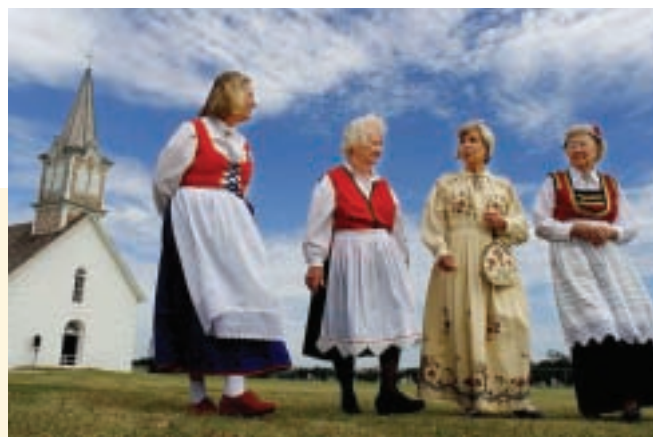
Fort Worth Star-Telegram

Known as the Kolache Capital of Texas, this 1850s town was located along Old San Antonio Road, a major artery for travel into Texas. Many of the state's Czech immigrants settled in Burleson County and each year, hundreds of people descend on the town to celebrate their heritage at the Kolache Festival, held in September. The rest of the year, visitors can explore local culture at the Burleson County Czech Heritage Museum. The museum displays folklore items and has a traditional Czech kitchen equipped with the necessities: a cabbage slicer for making sauerkraut and bottles of Pilsner. The Burleson County Museum, located in the basement of the Burleson County Courthouse, explores the county's history and displays artifacts of early settlers. Visitors can also stop by the newly opened Caldwell Visitor Civic Center, which features exhibits and a video documenting the town's history.