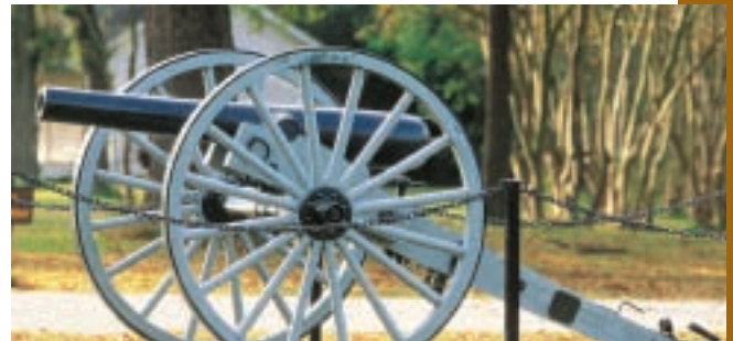
Confederate Reunion Grounds State Historic Site, Mexia