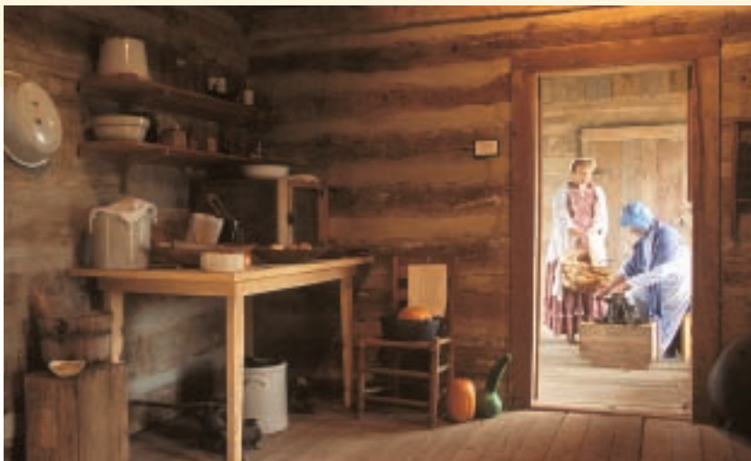
Pioneer Village, Lexington

Today, towns appear like scenes from a child's model railroad — a church, a passenger depot and a few shade trees. Visit these communities for a rare insight into a different time. Museums, historic sites, courthouse squares, old theaters and heritage festivals are among the exciting attractions awaiting visitors to the Texas Brazos Trail Region.