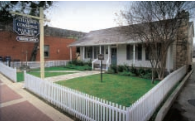
Palm House Museum, Round Rock

23erving weary travelers since the early 1860s.