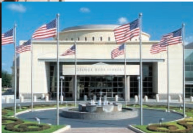
George Bush Presidential Library and Museum, College Station