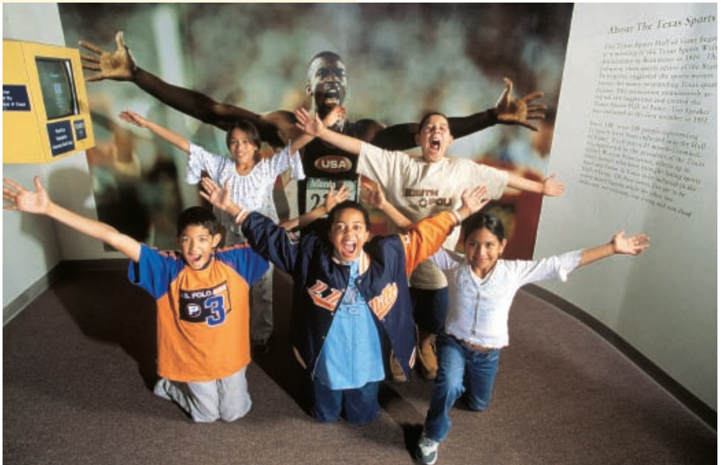
Texas Sports Hall of Fame, Waco

While in Waco, be sure to visit the popular Texas Sports Hall of Fame, dedicated to Texas sports heroes from George Foreman to Babe Didrikson Zaharias.