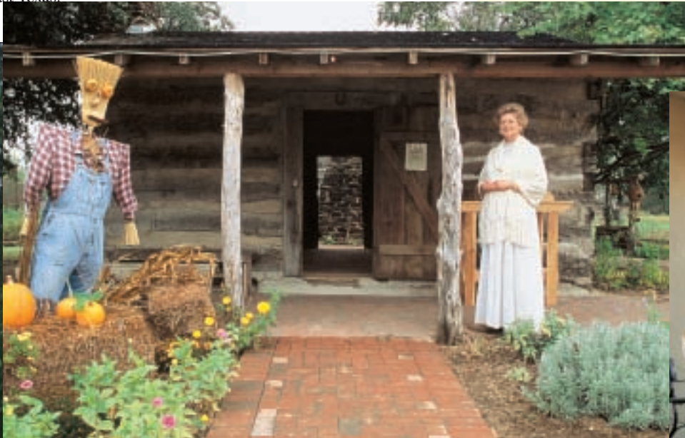
Pioneer Village, Lexington

The introduction of antibiotics and other modern medical treatments diminished the need for “taking the waters.” Marlin's grand bathhouses no longer stand, but the artesian wells still spew 48,000 gallons of 147-degree water each day. The geothermal energy is used to heat the chamber of commerce office and the hospital. At the Hot Water Pavilion downtown, visitors can touch the hot water pouring from a marble fountain. Across the street, a 1929 Hilton Hotel, one of the first built by hotelier Conrad Hilton, still stands as a poignant reminder of the