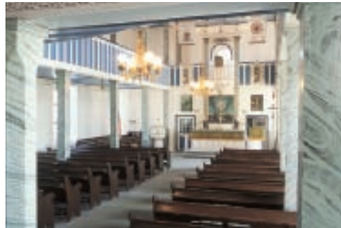
Wendish Church, Serbin

Wends, a distinct ethnic people of conservative Lutheran faith, established Giddings in 1872. The town’s historic courthouse and bustling downtown offer interesting shops and restaurants. The Lee County Heritage Center, housed in the 1879 Schubert-Fletcher Greek Revival home on the courthouse square, displays historical photos and other county artifacts.