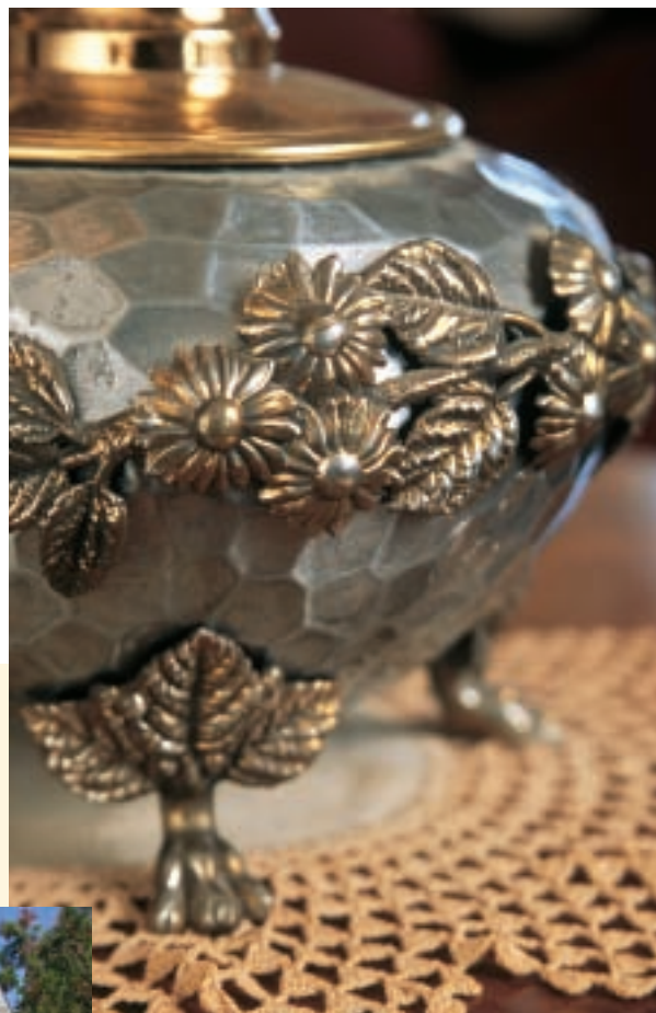
Fort House Museum, Waco

The communities of the Texas Brazos Trail Region played a vital role in the development of the state, both culturally and economically. The sites featured in this brochure remind us of that important contribution and allow us to experience the stories firsthand.