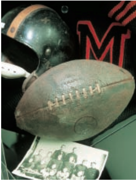
Public Schools Museum, Mexia