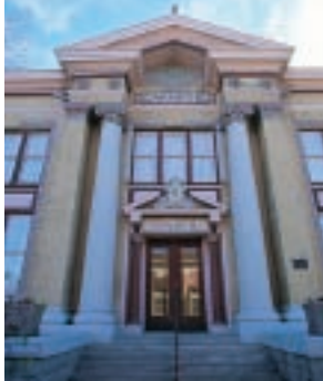
Bell County Museum, Belton

Founded in 1850, Belton grew as a trading center for nearby farms and ranches. Its merchants made the city a favorite rest stop for cowboys herding Longhorns up the Chisholm Trail. Today, visitors are drawn to the charming town square anchored by the magnificent Bell County Courthouse. Just off the square is the award-winning Bell County Museum, housed in a restored Beaux-Arts-style facility. Originally built as a Carnegie Library, the structure now features exciting, interactive exhibits that document the county's settlement and ranching history. The museum also features exhibits on two famous Bell County natives: acclaimed choreographer Alvin Ailey and Texas' first female governor Miriam A. "Ma" Ferguson.