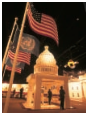
George Bush Presidential Library and Museum, College Station

Bryan's long, broad downtown commercial district features beautifully preserved historic buildings. An essential stop is the Greek Revival-style 1903 Carnegie Public Library, which houses a local history and genealogy center. Behind the library, the Children's Museum is a worthwhile stop if you're traveling with youngsters. Children can put on a puppet show, make crafts and climb through a tri-level "spaceship." Four miles from downtown Bryan, the Brazos Valley Museum of Natural History has a mural depicting the now-extinct mastodons, mammoths and saber-toothed cats that once roamed Texas. Check out the Pleistocene-era armadillo — a creature that would do serious damage to a pick-up truck. A fascinating exhibit chronicles the transport of cotton by ox cart, riverboat and rail. Also on display is a replicated chuck wagon, a mobile kitchen invented by cowboy Charles Goodnight that could feed a 10-man trail crew for 30 days.