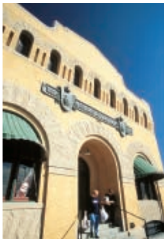
Dr Pepper Museum, Waco

An educational opportunity awaits visitors to the Heritage Homestead Traditional Craft Village in Elm Mott, north of Waco. The site offers classes in gardening, beekeeping, canning, soap making, quilting, weaving, spinning and more. At the visitors' center, travelers can buy fine handcrafted wood items and craft how-to books and kits. Thousands flock to this peaceful setting each November for a heritage festival that showcases crafts of yesteryear.