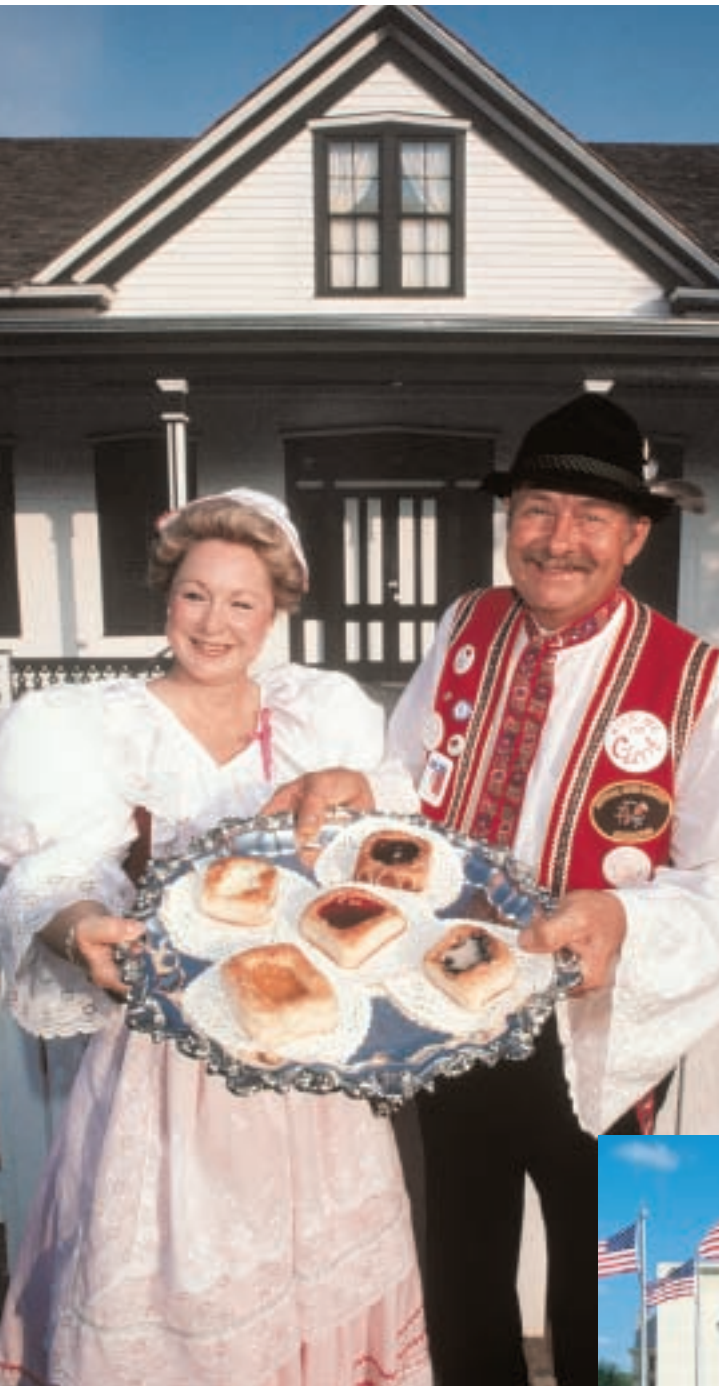
Kolache Festival, Caldwell