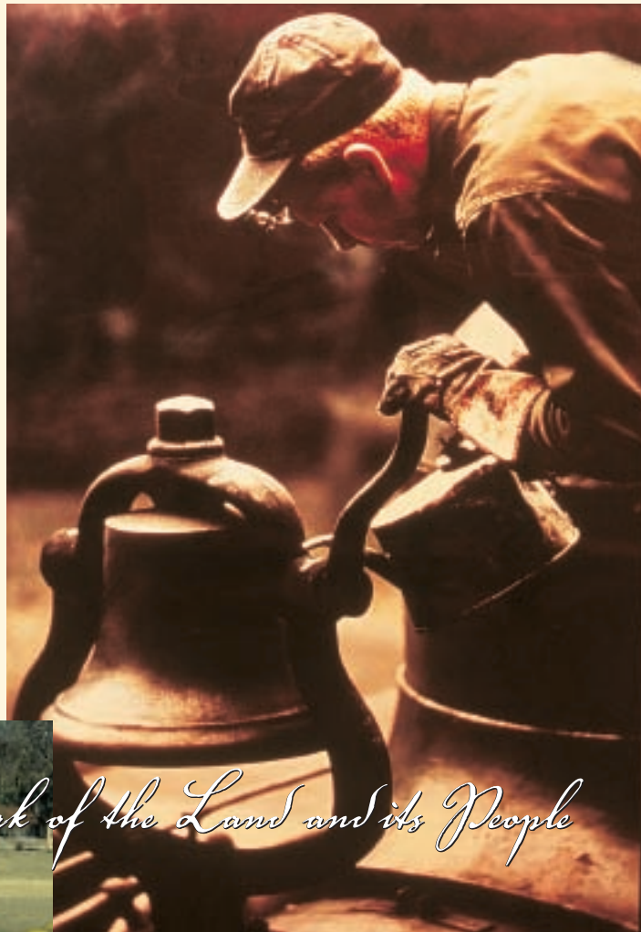
Railroad and Heritage Museum, Temple

H istory is determined not just by generals and frontier fighters, but by ordinary people living in little-known places. The Texas Brazos Trail Region is filled with legends of proud Native Americans who once roamed this land and courageous Spanish explorers who blazed the way for future settlers. Other stories feature determined men and women driving cattle north along the Chisholm Trail, cotton farmers struggling to get out of debt and townspeople with big dreams that rose and fell with the fortunes of the railroad.