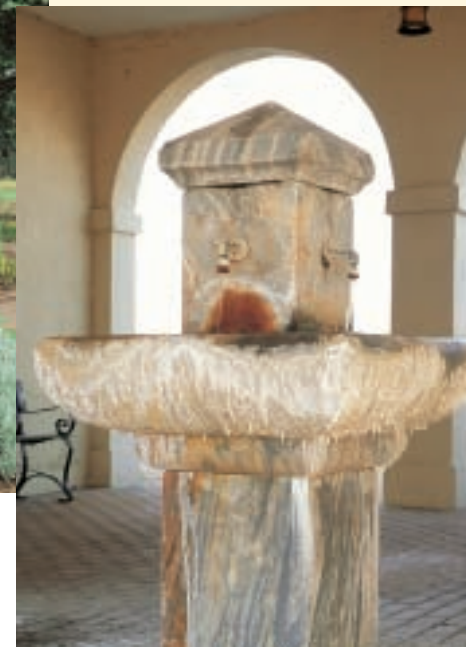
Hot Water Pavilion, Marlin