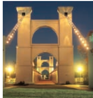
Suspension Bridge, Waco

of the Brazos River. Also downtown is the Dr Pepper Museum, where visitors can order a Dr Pepper float at the soda fountain and learn about the soft drink invented at the Old Corner Drug Store. The museum is housed in a handsome Richardsonian Romanesque building that served as the original headquarters and bottling plant.