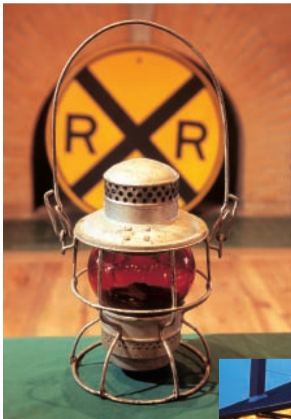
Elgin Union Depot Museum, Elgin

Established in 1872 around cotton and the railroads, Elgin is famous for two products it's been making since 1882: reliable bricks and delicious hot sausage. This small community just outside Austin produces 232 million bricks and 3 million pounds of sausage annually. Visitors can sample the famous sausage at any of the community's historic barbeque joints and at annual community celebrations like Western Days in June and the Hogeye Festival in October. The beautifully restored buildings in the historic district are made of locally produced brick dating from the 1890s. The new Elgin Union Depot Museum, in an award-winning restored depot, explores the history of the railroads, agriculture, transportation and the Swedes who settled the Blackland Prairies.