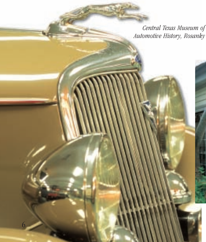
Central Texas Museum of Automotive History, Rosanky

Twelve miles south of Bastrop near Rosanky, the Central Texas Museum of Automotive History has an impressive display of more than 100 vintage cars, from a 1933 Duesenberg Roadster with rumble seat to an American icon, the '57 Chevy convertible. East of town, Bastrop State Park offers hiking, biking and camping in the "Lost Pines" — a remnant of loblolly pines far removed from the vast pine forests of East Texas. The park's roads, trails and cabins were built by the Civilian Conservation Corps (CCC). Their fine craftsmanship is particularly reflected in the refectory building, designed in the rustic style favored by the National Park Service.