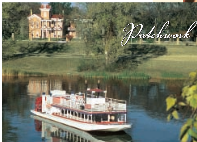
Spirit of the Rivers paddleboat with East Terrace House Museum, Waco