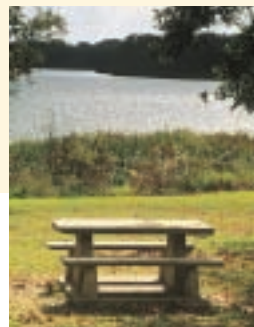
Fort Parker State Park, Mexia