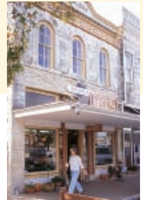
Georgetown Square, Georgetown