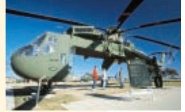
1st Cavalry Division Museum at Fort Hood, Killeen