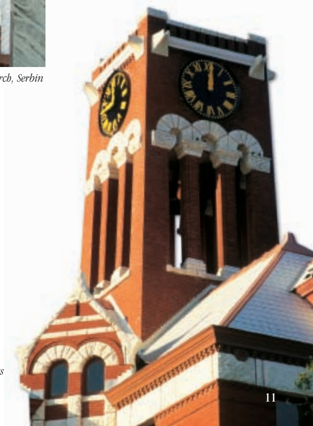
Lee County Courthouse, Giddings

Six miles south of Giddings, visitors can explore the original Wendish settlement of Serbin. Today, all that remains is a feed store and an intriguing old church. Next to the church, the Wendish Heritage Museum tells the story of these determined people, who emigrated here in 1854 in search of religious freedom and economic opportunities. A Slavic people — their language is closely related to Polish, Czech and Slovak — the Wends were a persecuted minority in Germanic Saxony and Prussia. Physically segregated, they were forbidden to own land and were denied admission to professional guilds. Under pressure to abandon their language and culture, 600 Wends gathered their possessions, sailed to America, and made the arduous journey inland by foot and ox cart to Lee County. In the 20th century, assimilation accomplished what political pressure could not: The Wends widely intermarried and dispersed, and today their language is nearly extinct.