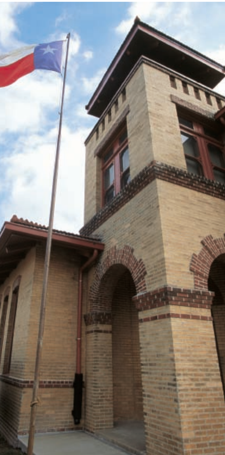
Burlington-Rock Island Railroad Museum, Teague