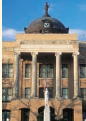
Williamson County Courthouse, Georgetown

Selected as a “Great American Main Street,” by the National Trust for Historic Preservation, Georgetown’s charming courthouse square is a favorite location of Hollywood film scouts. In the copper-domed courthouse in 1923, District Attorney (later Attorney General and Governor) Dan Moody prosecuted a decisive case against the Ku Klux Klan. The Williamson County Historical Museum, in the Beaux Arts Farmers Bank Building on the square, houses county history exhibits and archives. The Palace Theatre, with its distinctive Art Deco sconces and zigzags on the interior walls, has been restored and now hosts musical events and plays. Nearby Inner Space Cavern reveals a subterranean world of stalactites, stalagmites and the remains of prehistoric mastodons and wolves.