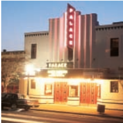
Palace Theatre, Georgetown