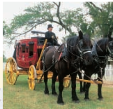
Fanthorp Inn State Historic Site, Anderson