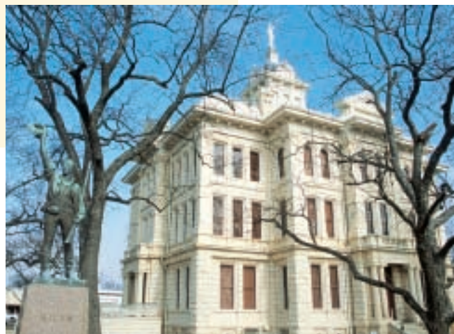
Milam County Courthouse, Cameron

A beautiful historic county courthouse with perfectly manicured grounds welcome guests to this charming community. For a glimpse into the past, explore a miniature model of Cameron, circa 1940, on display in the county clerk's office. For a more in-depth look at county memorabilia, visit the Milam County Historical Museum, which occupies the old county jail and a historic building on the square. The castle-like Romanesque-Revival structure, complete with gloomy cells and gallows tower, was restored as a jail and sheriff's living quarters. Just down the street, an old department store is home to the museum's impressive collection of county artifacts, including a compelling series of letters from soldiers during the Civil War, one describing the Battle of Antietam.