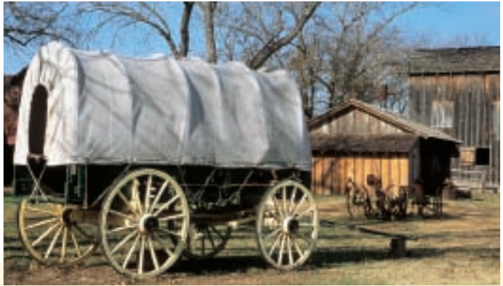
Mayborn Museum Complex, Waco

advent of river steamers and railroads, cotton buyers employed teamsters to make the overland trek, traversing the Brazos River at ferry crossings. Historical markers throughout the region mark the location of some of these early ferry crossings. By 1830, steamships started traveling the Brazos to ports farther south, making cotton transport easier, but the river was prone to flooding, and sandbars and snags made navigation difficult.