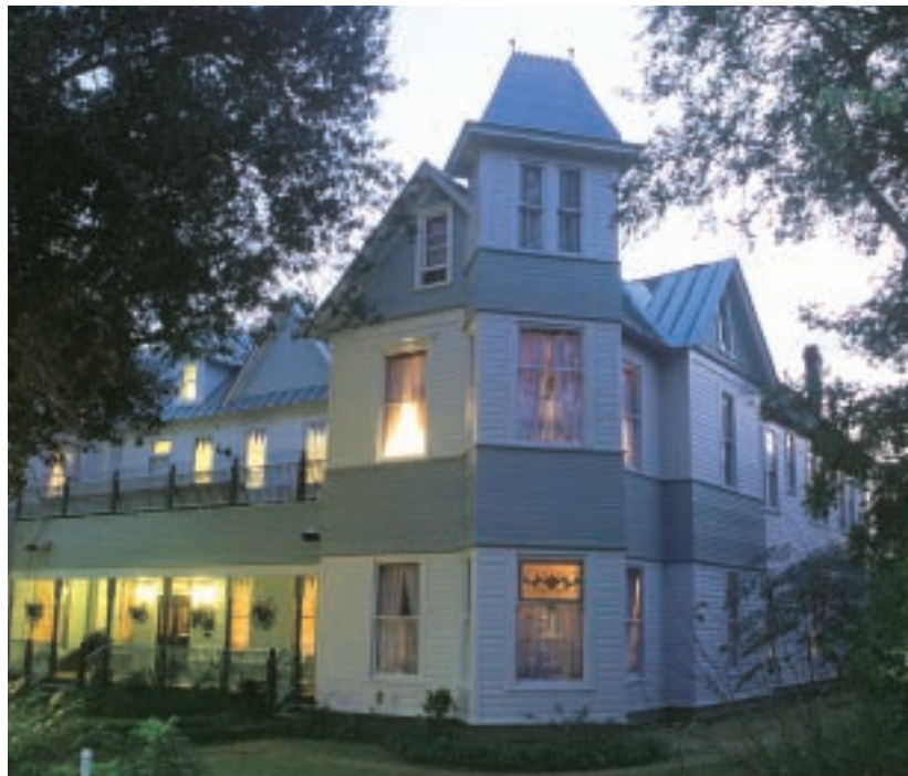
The Woodbine Hotel and Restaurant, Madisonville

This small farming community changed forever in 1942 when Camp Hood was established here in anticipation of U.S. involvement in World War II. Today, Fort Hood is the largest military base in the world and sprawls over 335 square miles. Two museums on base display the history of Fort Hood's two active divisions. The 1st Cavalry Division Museum explores the history of the division that was formed in Texas in 1921, was converted from horseback to helicopter prior to the Vietnam War, and now serves as an armored cavalry division. The 4th Infantry Division Museum traces the history of a division created to fight in World War I. Forces later landed at Utah Beach on D-Day and fought in the Battle of the Bulge during WWII, and in 2003 captured Saddam Hussein in Iraq.