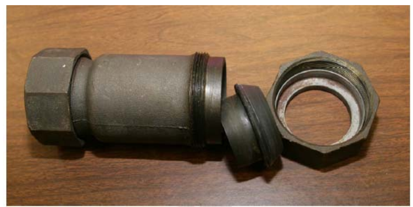
Figure 1 – Example of a Style 90 Type Dresser Coupling, Open Ended Barrel for View of Components

For the purpose of describing and explaining a typical coupling, the Dresser type coupling is pictured below. This information was extracted from a diagram created by PHMSA. Figures 1 and 2 provide examples of a typical Style 90 type Dresser coupling. A number of variations are available to join similar materials (such as steel to steel or PE to PE) or different materials (such as transitioning from steel to PE as in Figure 2). In addition to the straight coupling shown below, the Style 90 can also appear as an elbow (45 or 90 degree), tee, reducing coupling, or integrated with a riser. A variety of gaskets and sleeves exist depending on the specific application.