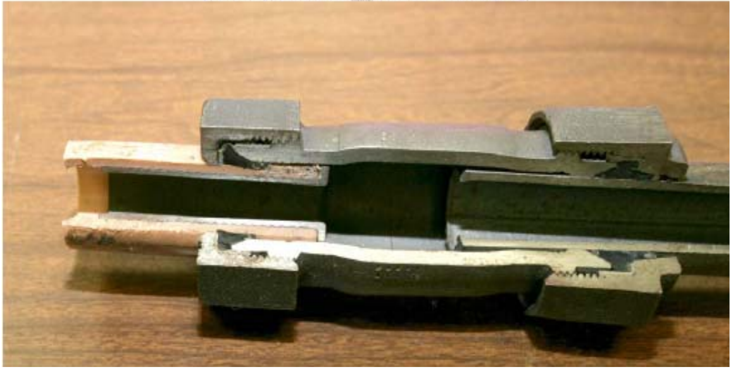
Figure 2 – Cut-away of Style 90 Type Dresser Coupling Transitioning Plastic to Steel

(Cut-away: Combination Plastic-to-Steel Coupling)