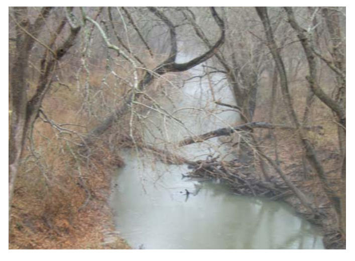
Plum Creek East of Luling.

Coming up in April, we are holding three public meetings across the watershed to engage stakeholders in this process through serving on the steering committee or a workgroup. The proposed workgroups will provide technical guidance to the steering committee on strategies for inclusion in the plan.