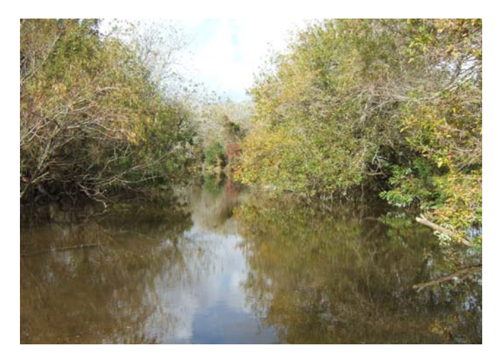
Garcitas Creek in Victoria County.