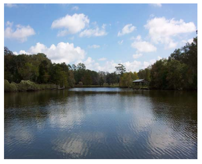
Dickinson Bayou.

Mark your calendars and please take time to attend the Dickinson Bayou Watershed Partnership meeting on April 19, 2006. The purpose of the meeting is to get the public's input on the watershed planning process. If you work, play or live in the Dickinson Bayou Watershed your participation is strongly encouraged. The meeting will be from 6:00 – 8:00 pm at the Barber Middle School – Captain's Room in Texas City (2218 Timber Dr., Dickinson, TX).