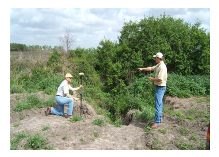
TSSWCB Field Office Staff Surveying Erosion Site in Wharton County.

www.tsswcb.state.tx.us/programs/wqmp.html.