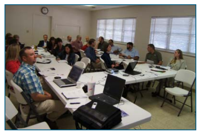
December 15, 2005 meeting in Columbus.

The WCSC provides guidance to the Regional Watershed Coordinator and steers the project to