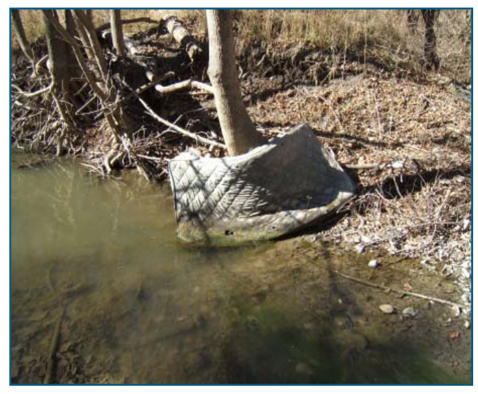
Stream "Bed" in Plum Creek.

At the December 15, 2005 WCSC meeting, Plum Creek, located in the Guadalupe River Basin, was selected as the first watershed for WPP development and implementation through this project. Plum Creek rises in Hays County north of Kyle and runs south through Caldwell County, passing Lockhart and Luling, and eventually joins the San Marcos River at their confluence in North Gonzales County.