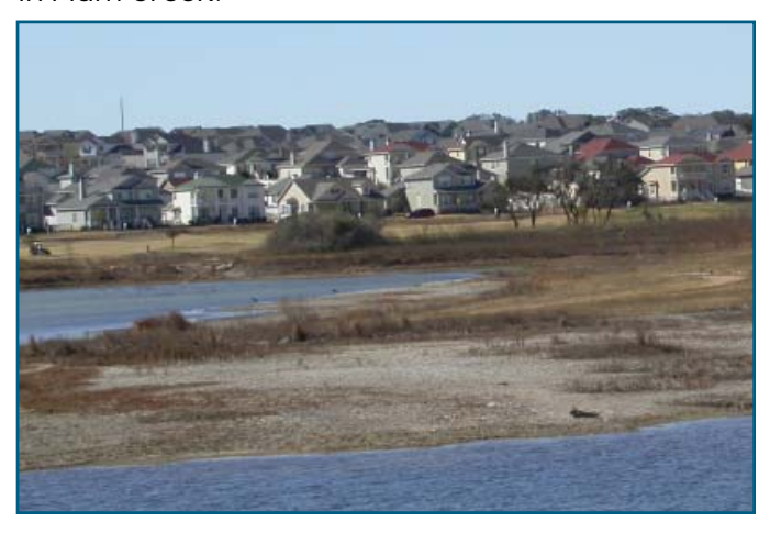
Heavy urban development occurring at the headwaters of Plum Creek in Kyle.

Plum Creek Watershed has very diverse land use, with the upper reaches consisting of heavy urban development, while the lower portion has significant agriculture, such as row crops, hay and livestock grazing. Additionally, petroleum activity is veryhigh around Luling. This diversity of land use exemplifies some of the challenges ahead in order to restore and maintain good water quality in Plum Creek.