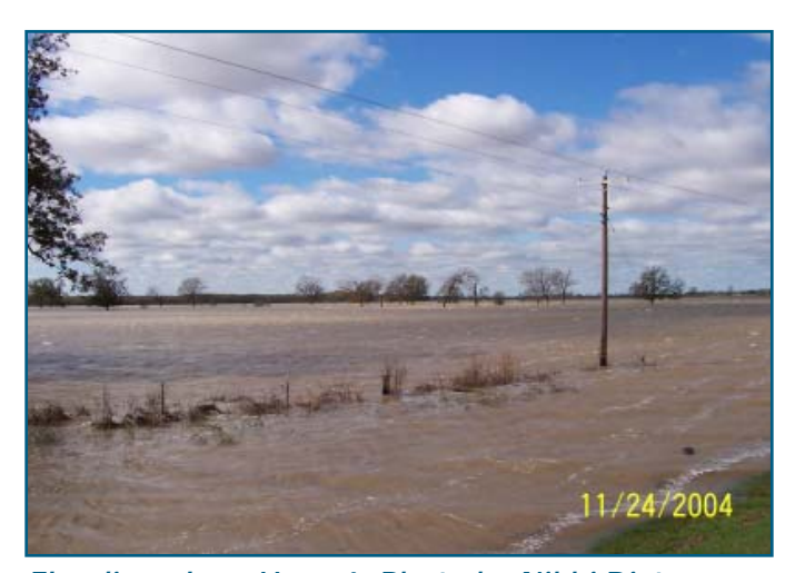
Flooding along Hwy. 6.

For more information, see TCE publication B-6157, "A Texas Field Guide to Evaluating Rangeland Stream & Riparian Health" at <a href="http://tcebookstore.org">http://tcebookstore.org</a>.