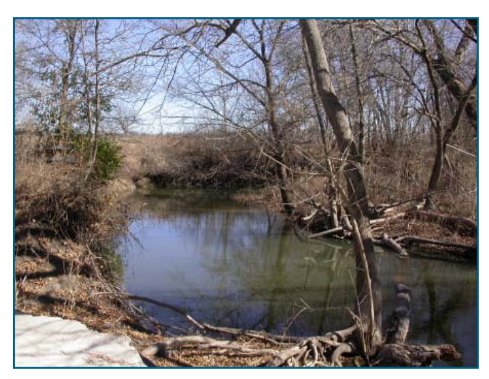
Plum Creek in Caldwell County.

Stream and riparian ecosystems are very important to the water issues facing Texans today and into the future. Healthy streams and riparian areas are among the most productive resources found on Texas rangelands. Healthy stream and riparian ecosystems provide clean water, sustain flow in rivers and act like sponges to soak up and store flood waters, recharging shallow water tables and reducing downstream flood damage. They also improve wildlife habitat and livestock productivity through increased soil infiltration and water capture during storms. To provide these benefits, the streams and rivers