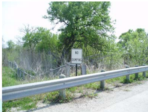
• Plum Creek at Old Kelly Road (CR 186) No Dumping Sign 39