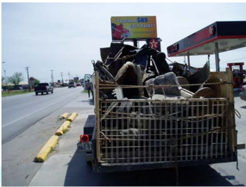
• Plum Creek at Old Kelly Road (CR 186) Day 3 Refuse 47