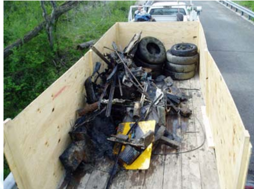
• Plum Creek at Whisper Road (CR 135) Post-Cleanup Refuse 14