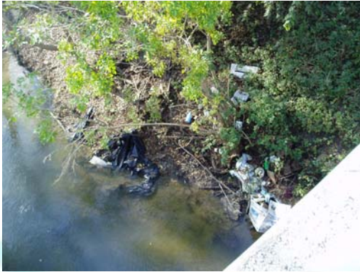
• Plum Creek at Biggs Road (CR 131) Downstream View Pre-Cleanup