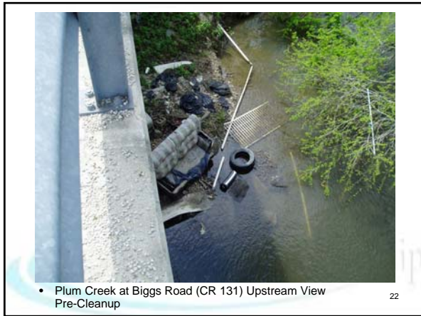
• Plum Creek at Biggs Road (CR 131) Upstream View Pre-Cleanup 22