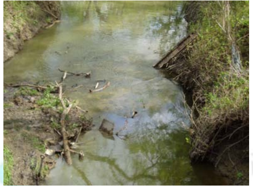
• Plum Creek at Old McMahon Road (CR 202) Downstream View Post-Cleanup 38