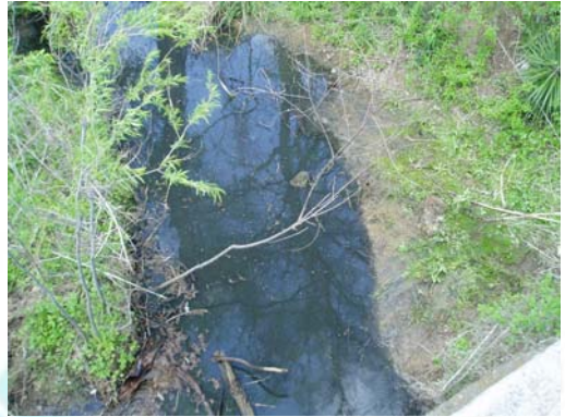
• Copperas Creek at Wattsville Road (CR 140) Downstream View 32 Post-Cleanup