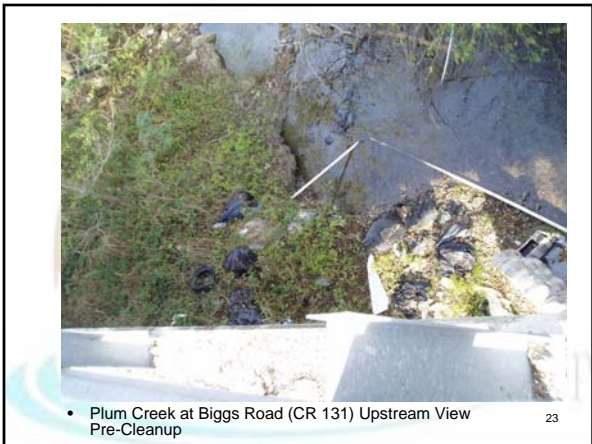
• Plum Creek at Biggs Road (CR 131) Upstream View Pre-Cleanup 23