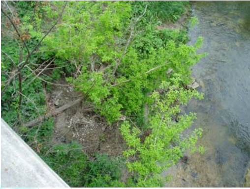
• Plum Creek at Old Kelly Road (CR 186) Downstream View Post-Cleanup 43