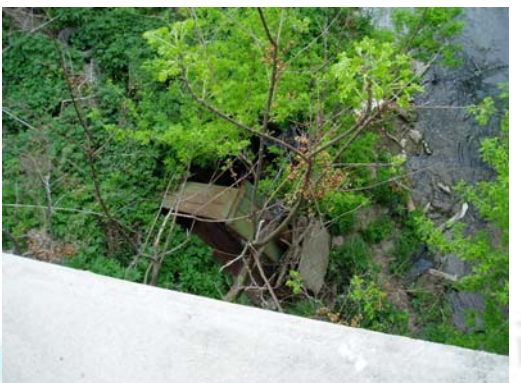
• Plum Creek at Old Kelly Road (CR 186) Downstream View Pre-Cleanup 42