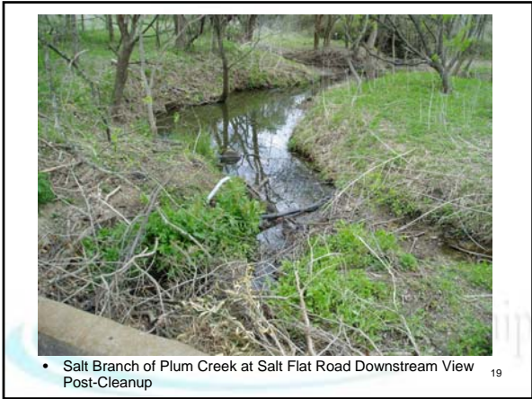
• Salt Branch of Plum Creek at Salt Flat Road Downstream View Post-Cleanup 19