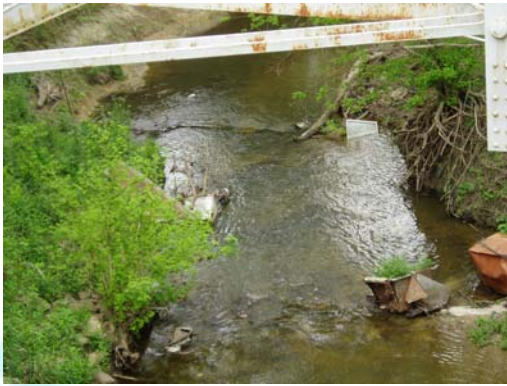
• Plum Creek at Old Kelly Road (CR 186) Downstream View Pre-Cleanup 45