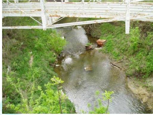
• Plum Creek at Old Kelly Road (CR 186) Downstream View Pre-Cleanup 44