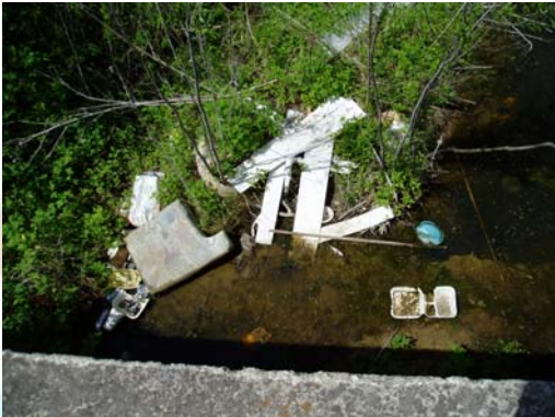
• Copperas Creek at Wattsville Road (CR 140) Downstream View Pre-Cleanup