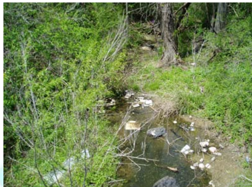
• Copperas Creek at Wattsville Road (CR 140) Downstream View 33 Pre-Cleanup