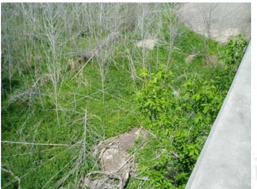
• Plum Creek at Old Kelly Road (CR 186) Upstream View Pre-Cleanup 40