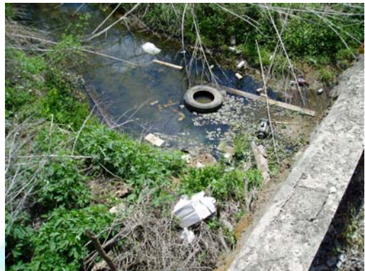
• Copperas Creek at Wattsville Road (CR 140) Upstream View 35 Pre-Cleanup