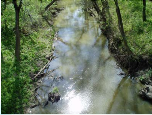
• Plum Creek at Whisper Road (CR 135) Downstream View Post-Cleanup 13