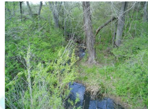
• Copperas Creek at Wattsville Road (CR 140) Downstream View 34 Post-Cleanup