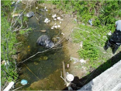
• Copperas Creek at Wattsville Road (CR 140) Downstream View 31 Pre-Cleanup