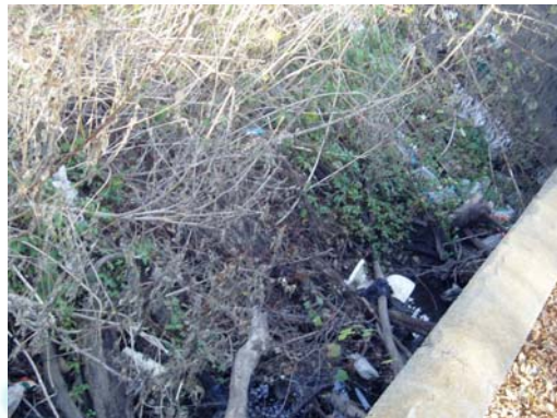
• Salt Branch of Plum Creek at Salt Flat Road Upstream View Pre-Cleanup 16