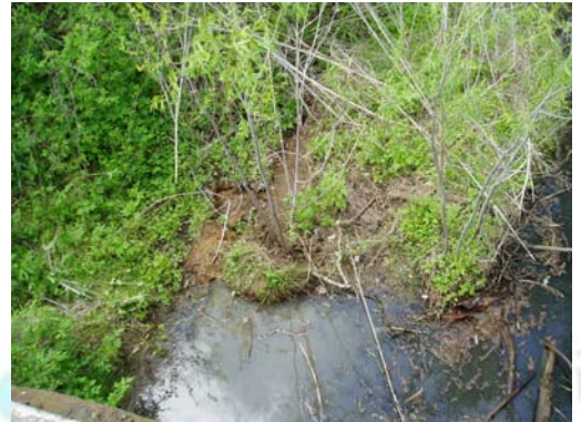
• Copperas Creek at Wattsville Road (CR 140) Downstream View Post-Cleanup