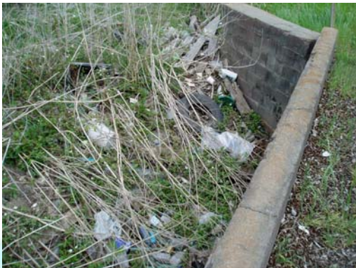
• Salt Branch of Plum Creek at Salt Flat Road Upstream View Pre-Cleanup 15