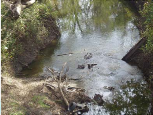
• Plum Creek at Old McMahon Road (CR 202) Downstream View Pre-Cleanup 37