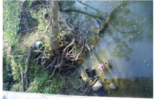
• Plum Creek at Biggs Road (CR 131) Downstream View Pre-Cleanup