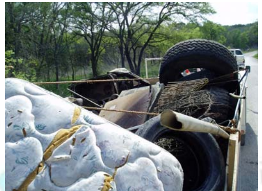
• Plum Creek at Biggs Road (CR 131) Post-Cleanup Refuse