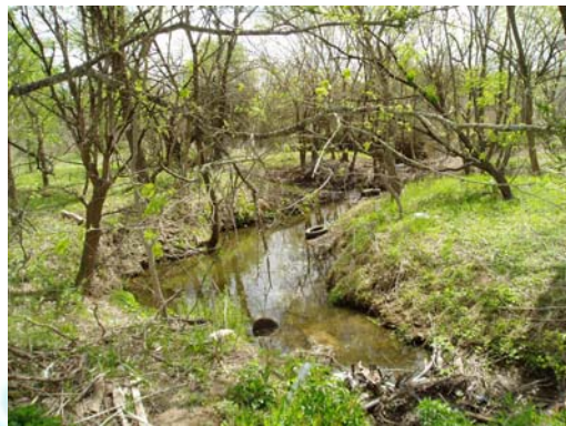
• Salt Branch of Plum Creek at Salt Flat Road Downstream View Pre-Cleanup 18