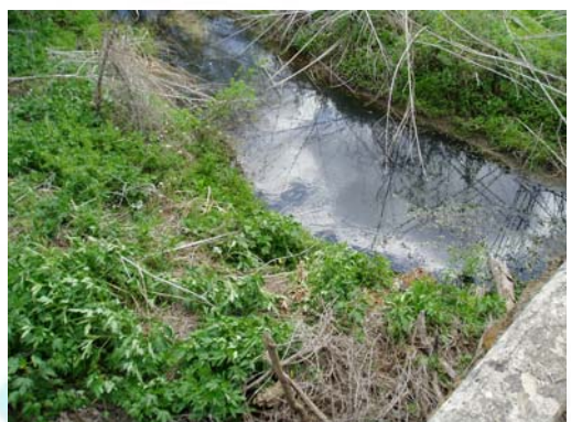
• Copperas Creek at Wattsville Road (CR 140) Upstream View 36 Post-Cleanup