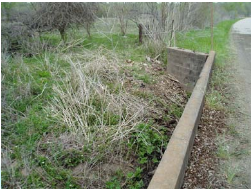
• Salt Branch of Plum Creek at Salt Flat Road Upstream View Post-Cleanup 17