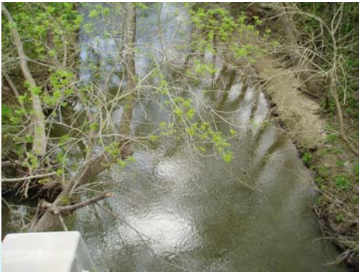
• Plum Creek at Biggs Road (CR 131) Downstream View Post-Cleanup