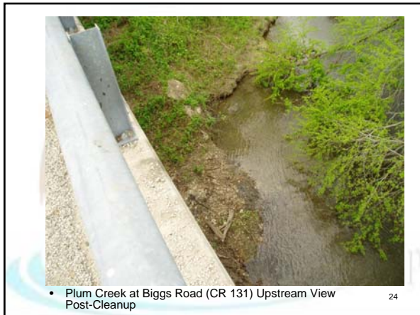
• Plum Creek at Biggs Road (CR 131) Upstream View Post-Cleanup 24