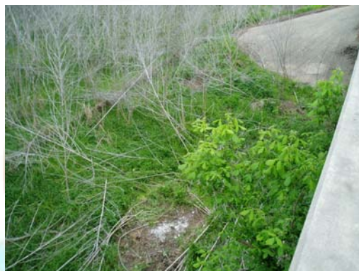
• Plum Creek at Old Kelly Road (CR 186) Upstream View Post-Cleanup 41