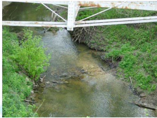
• Plum Creek at Old Kelly Road (CR 186) Downstream View Post-Cleanup 46