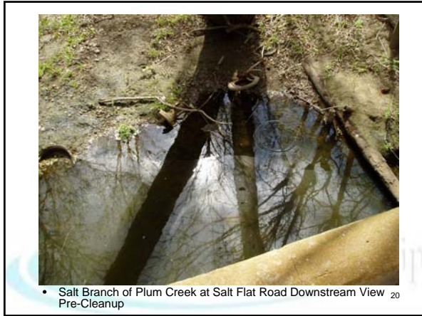
• Salt Branch of Plum Creek at Salt Flat Road Downstream View Pre-Cleanup 20