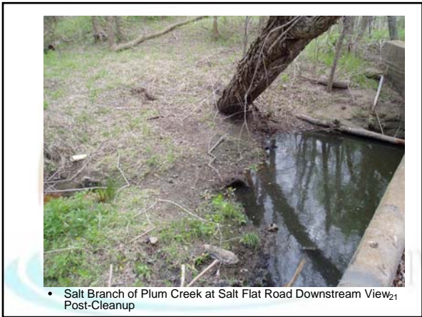
• Salt Branch of Plum Creek at Salt Flat Road Downstream View Post-Cleanup 21