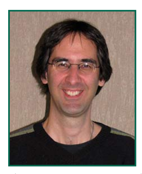
Ph.D., Princeton University, Atmospheric and Oceanic Science, 2001 CIRA Postdoctoral Fellow in Fort Collins, CO