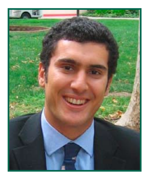
Ph.D., Chemical Engineering, California Institute of Technology (Caltech), 2008 CIRA Postdoctoral Fellow in Boulder, CO