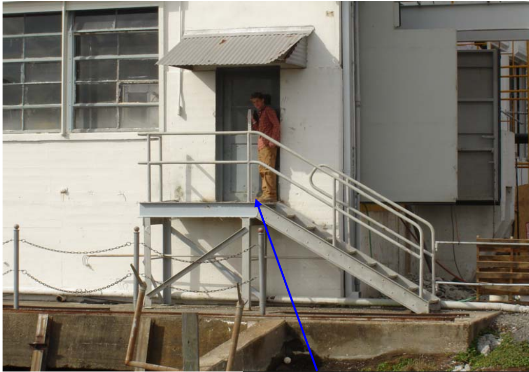
Finished Floor 4.805 feet NAVD88 2004.65