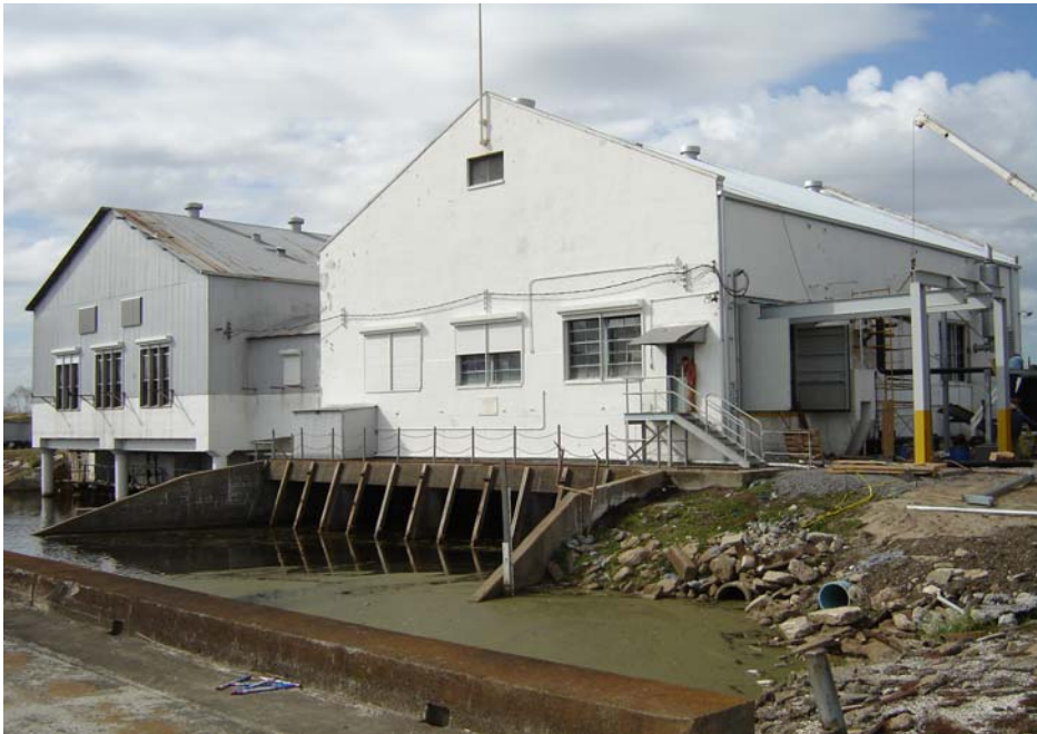
BELLE CHASE #1 Pump Station