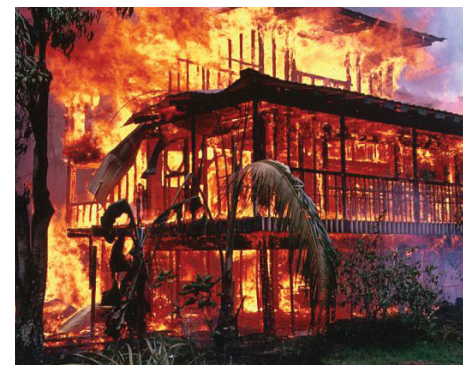
This house in Kalapana, Hawaii, is burned by approaching lava from Kilauea Volcano on Sunday, April 22, 1990. Most of Kalapana was destroyed by lava flows between 1986 and 1990, with 180 homes lost.

The USGS helps the public, policy-makers, and emergency managers make informed decisions on how to prepare for and react to volcano hazards and reduce losses from future volcanic eruptions and debris flows.