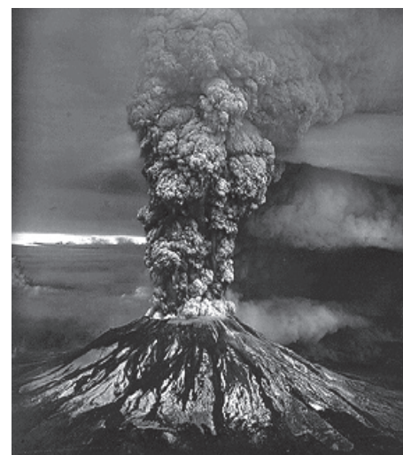
Mount St. Helens in Washington State explosively erupts on Sunday, May 18, 1980. The eruption led to 57 deaths.

Noxious volcanic gas emissions have caused widespread lung problems. Airborne ash clouds have disrupted the health, lives, and businesses of hundreds of thousands of people; caused millions of dollars of aircraft damage; and nearly brought down passenger flights.