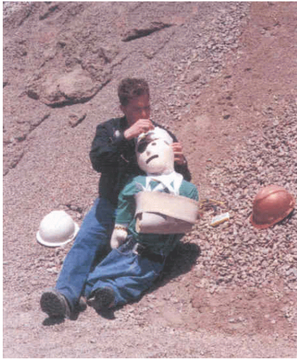
Ignoring the safety rules results in an accident.