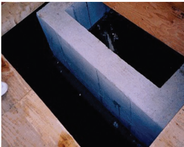
Figure 2. Unguarded floor opening.

A 39-year-old, self-employed residential construction contractor died after falling through an unguarded floor opening and onto the concrete footing 10 feet below (Figure 2). He was framing the second floor with two other workers and was in the process of holding a level to the gable end of the second-floor master bedroom when