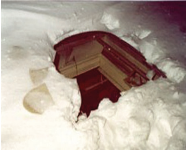
Figure 1. Snow-covered 3-foot-square skylight.

The skylight did not have a protective screen, cover, or guarding around it [Wisconsin Department of Health and Family Services 1999].