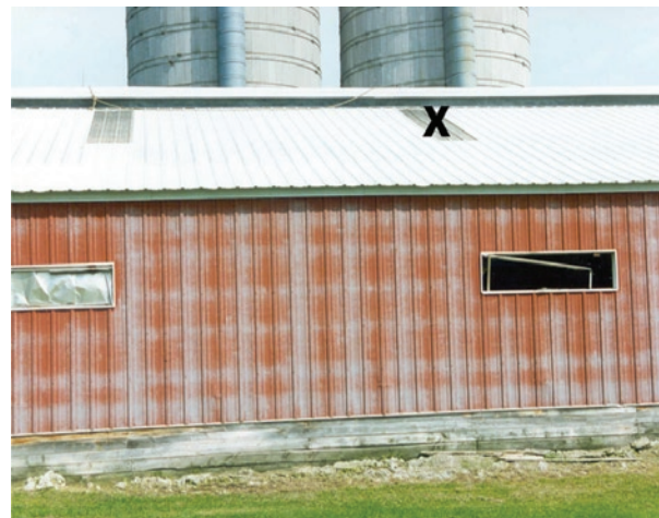
Figure 3. Fiberglass panel on metal roof (marked with an X).

A 62-year-old farmer died from injuries sustained when he fell through a corrugated fiberglass panel used on the roof of a pole barn to let light into the building (Figure 3). On the day of the incident, the farmer drove a tractor equipped with a front-end loader next to the barn. He used the loader bucket to climb onto the roof. He walked up the slope of the roof until he reached a rope tied into the roof vent. Evidence suggests that he held the rope in one hand as he pushed snow off the roof. He stepped onto a snow-covered 3- x 10-foot corrugated fiberglass panel that broke, causing him to fall approximately 16 feet to the concrete floor below. The fiberglass panel had not been guarded or marked with a warning to indicate that it covered a hole [Minnesota Department of Health 1994].