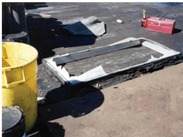
Figure 4. Rectangular skylight after it had been removed from the roof and placed on the ground.

A 14-year-old male laborer died from injuries he sustained when he fell through the lens of a 56- x 24-inch, curb-mounted skylight to a concrete floor approximately 12 feet below (Figure 4). Along with several other day laborers, the victim and his 16-year-old brother had been hired by a roofing contractor on the day of the incident to pull up and remove built-up roofing materials from the flat roof of a one-story wholesale florist shop. The victim had been working for approximately 15 minutes pulling up roofing materials by hand when he fell back onto a skylight lens that broke under his weight. The skylight did not have a protective screen, cover, or