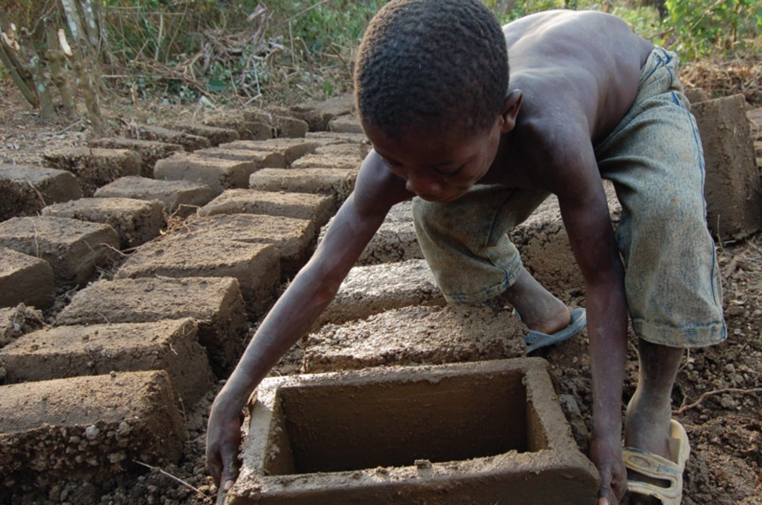
A young boy works 12-hour days packing mud bricks in Liberia.