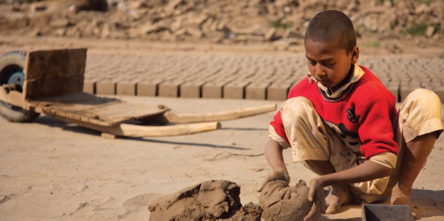
A Pakistani boy works in a brick kiln on the outskirts of Lahore in Pakistan. His parents owe the brick kiln owner 5,000 Pakistani rupees (less than US $100). Because of this debt, they work as bonded laborers.

protection of victims, and prevention efforts. The analysis is based on the TVPA standards.