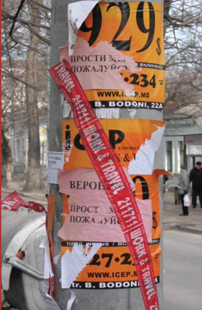
Telephone poles covered in advertisements for overseas work are common in Chisinau, Moldova.