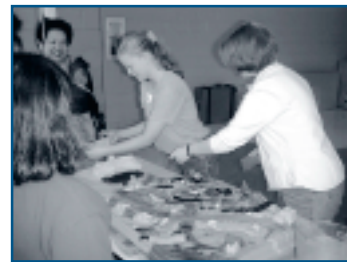
Classroom projects and field trips get young people excited about studying and protecting wetlands.

Wetlands can also be incorporated into classroom work in the context of many subjects. As a natural feature of the environment, wetlands can be studied in physical science, biology, or even water chemistry units. Many wetlands are restored or protected by community cooperation and hard work, lending to studies in civics and sociology. The beauty and serenity of wetlands provide the perfect setting to practice art or to discuss and enjoy literature.