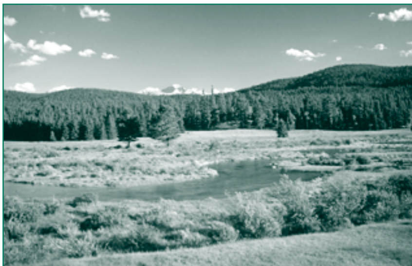
Wetlands are among the most biologically diverse ecosystems in the world.