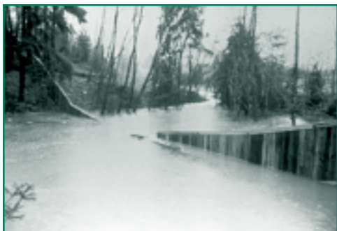
Because of their strategic position in the landscape, wetlands help attenuate flooding.