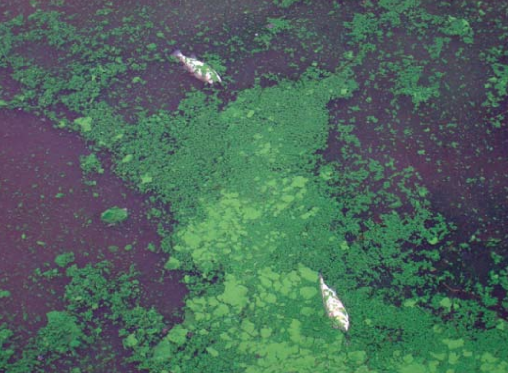
Figure 2. Near-shore accumulation of cyanobacteria.