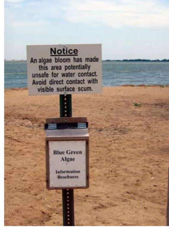
Figure 3. Beach sign warning of the presence of a cyanobacterial bloom.