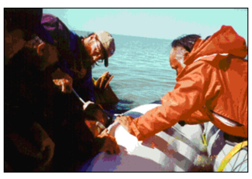
Tagging: NOAA researchers and Native subsistence hunters work together to attach tags. Here 3/8" pins are inserted into the skin and blubber of the whale to hold the tag.

Biopsy samples and life history data are used for various studies. Skin samples will provide genetic information and can be used to identify individual whales and the stock that they came from. The blubber is analyzed to determine the whale's diet and contaminant loads. The blood yields information on the general health and condition of the whale, as well as specific information on pathogens, parasite loads, and hormone levels.