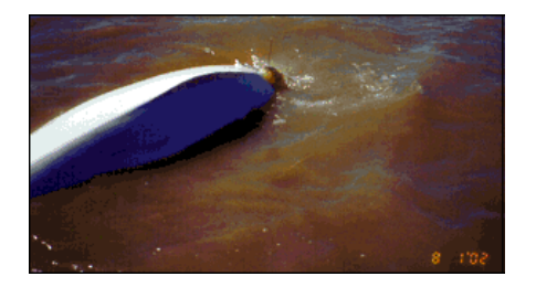
Whale swims off with newly attached tag.