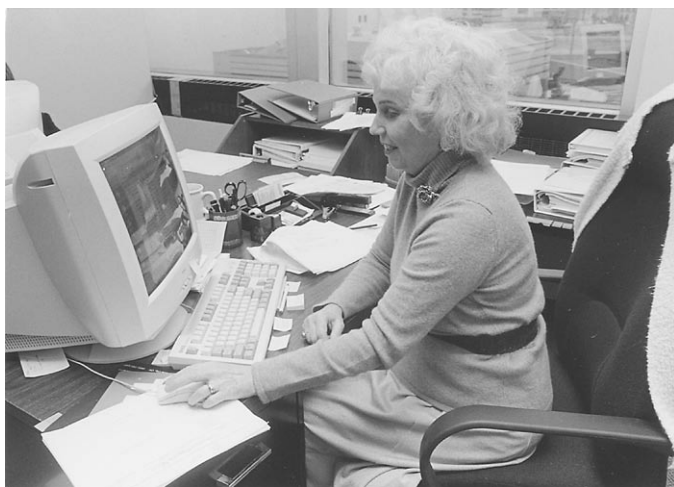
A bachelor's degree in engineering is required for most entry-level jobs.

Education and training. A bachelor's degree in engineering is required for almost all entry-level engineering jobs. College graduates with a degree in a natural science or mathematics occasionally may qualify for some engineering jobs, especially in specialties in high demand. Most engineering degrees are granted in electrical, electronics, mechanical, or civil engineering. However, engineers trained in one branch may work in related branches. For example, many aerospace engineers have training in mechanical engineering. This flexibility allows employers to meet staffing needs in new technologies and specialties in which engineers may be in short supply. It also allows engineers to shift to fields with better employment prospects or to those that more closely match their interests.