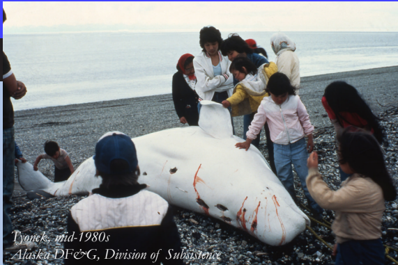
Tyonek, mid-1980s Alaska DFG, Division of Subsistence