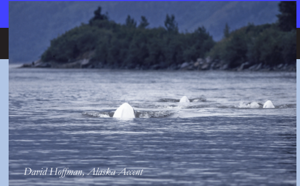
David Hoffman, Alaska Accent

In accordance with the Plan , there will be no harvest from 2008 to 2012 because the most recent 5-year population average (2003 - 2007) was 336 belugas.