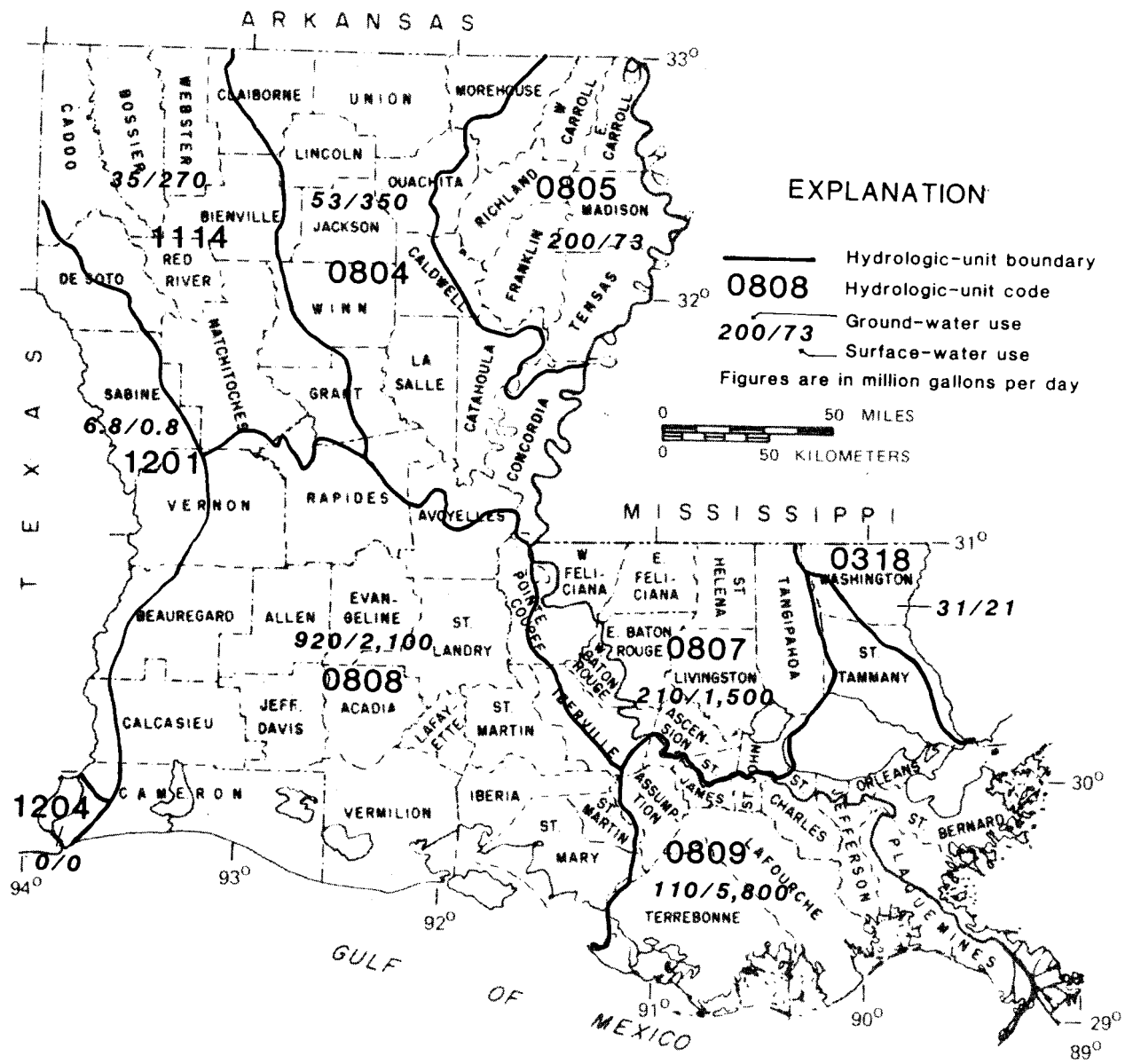
Figure 2.--Water use in major hydrologic units in Louisiana, 1975.