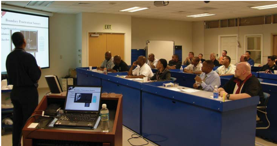
FPS personnel at security training session.

The first of its kind, this two-day training session covers the following topics: