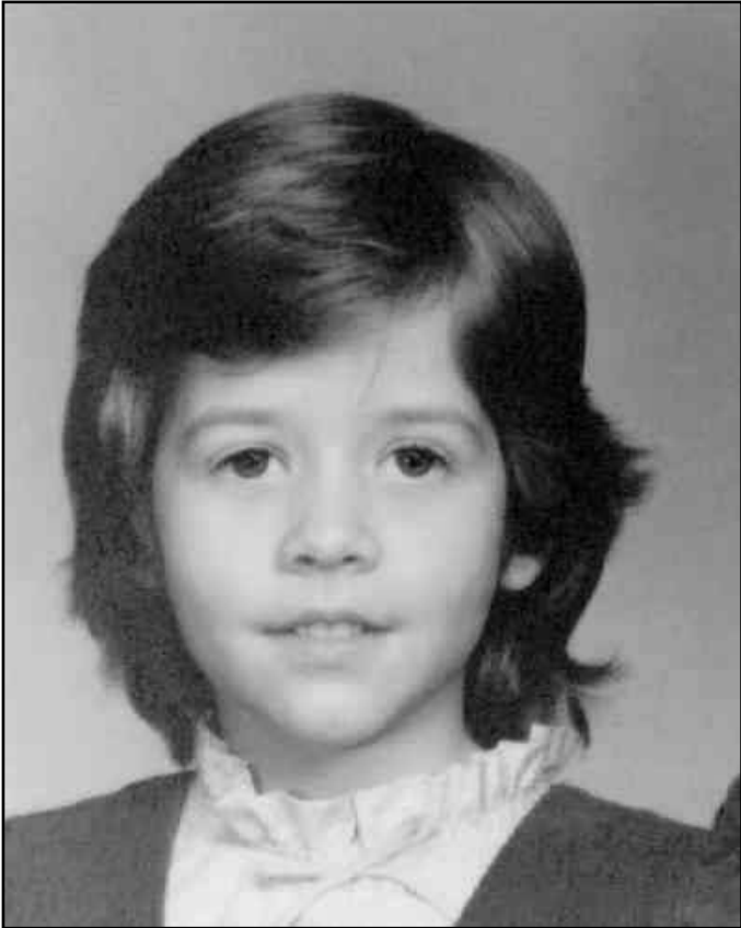
Female, Age Now: 19 Blue eyes, Blonde hair