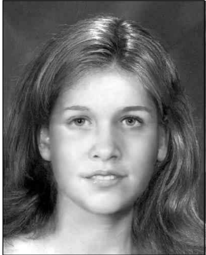
Age Progression By NCMEC