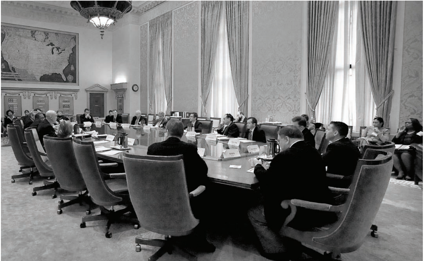
The Federal Financial Institutions Examination Council in Session.

The following section is a chronological record of the official actions taken by the FFIEC during 2008 pursuant to the Federal Financial Institutions Examination Council Act of 1978, as amended, and the Home Mortgage Disclosure Act (HMDA).