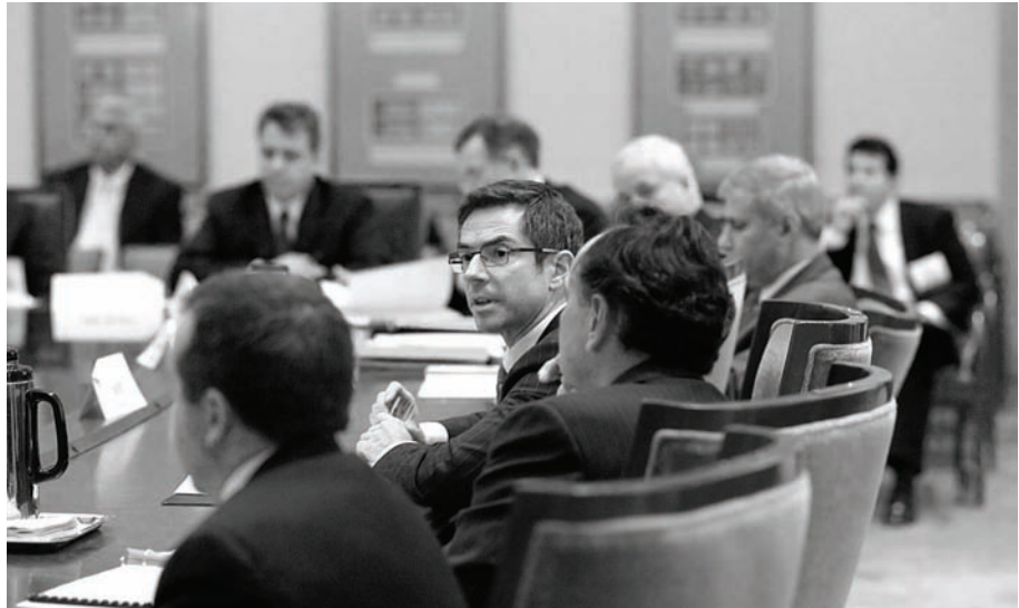
Members of the Council Engaged in Discussions During the October 2008 Council Meeting.

Explanation. The Council is required to approve task orders that exceed a specific dollar amount.