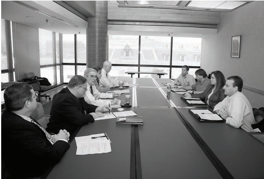
Task Force on Surveillance Systems meeting.

ance Corporation, or the Office of the Comptroller of the Currency. UBPR data are also available to all state bank supervisors. While the UBPR is principally designed to meet the examination and surveillance needs of the federal and state banking agencies, the task force also makes UBPRs available to banks and the public through a public web site; www.ffiec.gov .