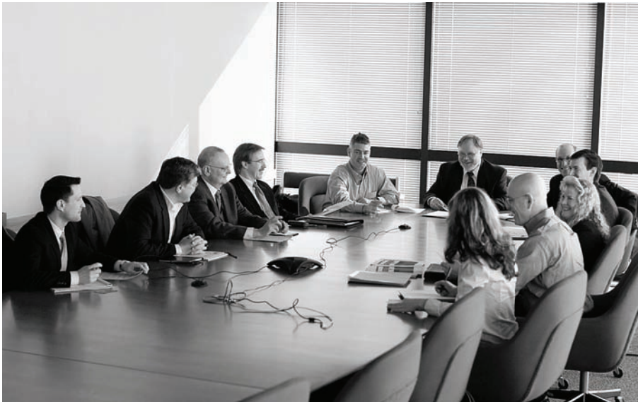
Task Force on Information Sharing meeting.

and supervisory data. The working group also maintains a Task Scope Matrix to identify and provide status reports on all outstanding work group projects and an inventory of possible future technology projects. In addition, the working group continues to develop necessary links and processes to exchange electronic documents and to store documents and critical materials on interagency information changes in the collaborative web site repository.