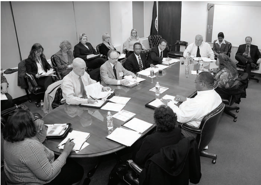
Task Force on Consumer Compliance meeting.

The task force approved Regulation DD (Truth in Savings) examination procedures to comply with regulatory changes on electronic disclosures and to incorporate the GAO's recommendation related to institutions' provision of disclosure information on bank fees to consumers.