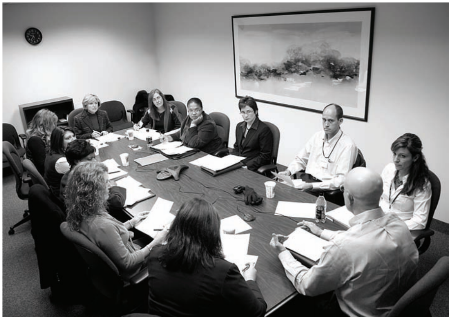
Task Force on Examiner Education meeting.

The Task Force on Examiner Education is responsible for overseeing the FFIEC's examiner education program on behalf of the Council. The task force promotes interagency education through timely, cost-efficient, state-of-the-art training programs for agency examiners and staff. The task force develops programs on its own initiative and in response to requests from the Council or other Council task forces. Each fall, task force staff prepares a training calendar based on demand