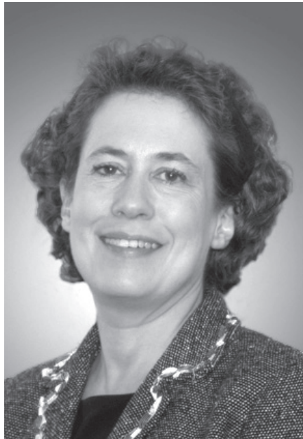
Sheila C. Bair, Vice Chairman Chairman Federal Deposit Insurance Corporation