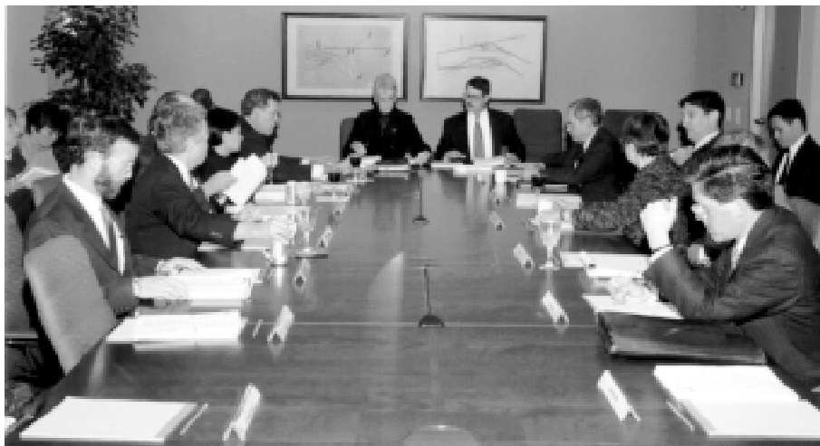
The Examination Council in Session.

The following section is a chronological record of the official actions taken by the Federal Financial Institutions Examination Council during 1998 pursuant to sections 1006, 1007, and 1009A of the Federal Financial Institutions Examination Council Act of 1978, Public Law 95-630; section 304 of the Home Mortgage Disclosure Act (HMDA), Public Law 94-200; and the Riegle Community Development and Regulatory Improvement Act of 1994 (RCRDIA), Public Law 103-325.