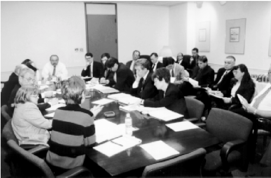
Task Force on Supervision

task force, and the banking agencies are currently surveying Call Report users within the agencies and are continuing to review the uses of individual Call Report items in order to ascertain their relative importance to the agencies. These actions are part of the agencies' ongoing effort to eliminate Call Report information with the least practical utility and to increase uniformity among regulatory reports.