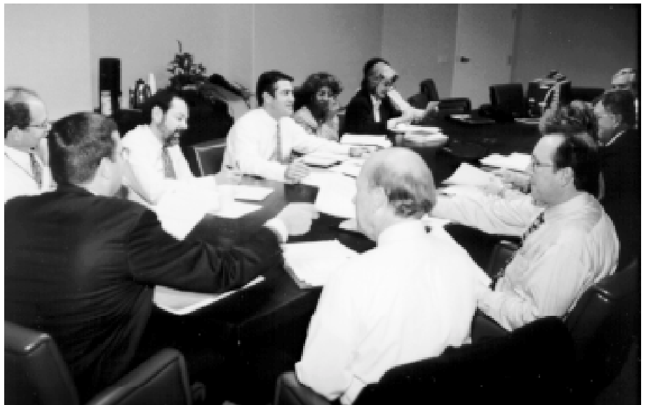
Task Force on Information Sharing

The Structure Data Reconciliation Group focus for 1999 is to broaden the scope of the reconciliation