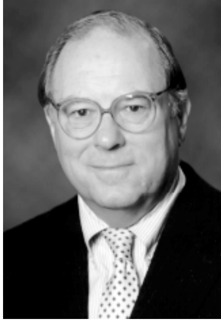
John D. Hawke, Jr., Chairman Comptroller of the Currency Office of the Comptroller of the Currency