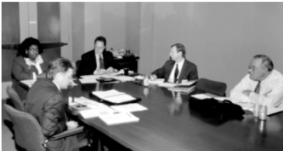
Task Force on Consumer Compliance

The Automation Subcommittee provides the task force with technical support by undertaking projects that require coordination with other automation groups by the developing of applications for FFIEC benefit. In August 1998, the subcommittee completed the development of a searchable FFIEC CRA ratings database and provided public access to the database through the FFIEC website. During 1999, the subcommittee will continue to analyze the technical and functional feasibility of developing a secure "extranet" for compliance staff of member agencies to use to share information. The subcommittee will also enhance the searchable FFIEC CRA ratings database in response to consumer and agency recommendations.