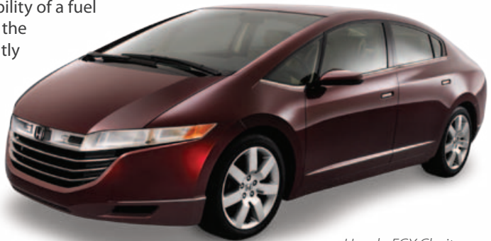
Honda FCX Clarity

Honda rolled out its FCX Clarity in 2008 and leased 200 vehicles for three years to drivers in Southern California to collect real-world driving data. Honda's fuel cell vehicle is powered by a motor running on electricity generated by a hydrogen-powered fuel cell stack. The compact, high-efficiency lithium-ion battery pack is used as a supplemental power source capturing lost energy during deceleration and braking. The ultimate viability of a fuel cell fleet will be based on the vehicle's ability to efficiently use and economically produce and store hydrogen fuel and the willingness of car owners to fuel with hydrogen.