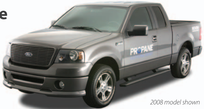
2008 model shown