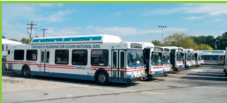
Figure 3. Tiger Teams Have Assisted the Washington Metropolitan Area Transit Authority with Natural Gas Bus and Infrastructure Challenges