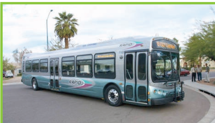
Figure 1. Liquefied Natural Gas Bus Operated by Arizona's Valley Metro

The TUG provides information and technical assistance to help transit agencies deploy and operate natural gas buses and infrastructure. Participation is intended for transit agency