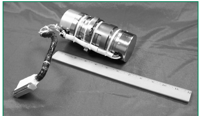
Rate Sensor Assembly

of 19,200 rpm on gas bearings. This wheel is mounted in a sealed cylinder, which floats in a thick fluid. Electricity is carried to the motor by thin wires (approximately the size of a human hair) which are immersed in the fluid. Electronics within the gyro detect very small movements of the axis of the wheel and communicate this infor-