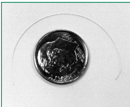
Tiny Wires Inside Gyroscope Assembly

Three of the Hubble's six gyros are not working, leaving only the minimum number needed to continue its science program. At present the Telescope continues to operate normally with no impact to its mission. However, should another gyro go offline, Hubble will automatically place itself into a protective safe mode. In this mode,